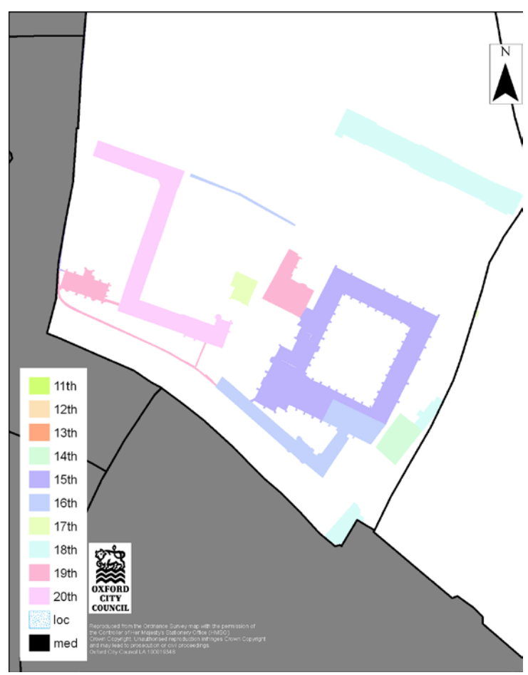
Listed buildings by date of earliest identified fabric (based on listing description)

The college buildings are grouped broadly into three blocks, the 15<sup>th</sup> century two storey cloistered Great Quadrangle and adjacent ranges centred around the remaining fabric of the medieval hospital of St John. The 18<sup>th</sup> century simplified neo-Palladian range and lawns of the New Buildings to the north, and the Victorian gothic buildings of St Swithins Quadrangle and Longwall Quadrangle that represent the westward extension of the college