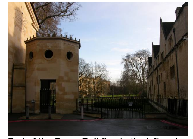
Part of the Grove Building to the left and Victorian Longwall Quadrangle to the right.