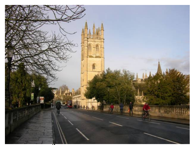
The late 15<sup>th</sup> century Magdalem College Bell tower viewed from Magdalen Bridge