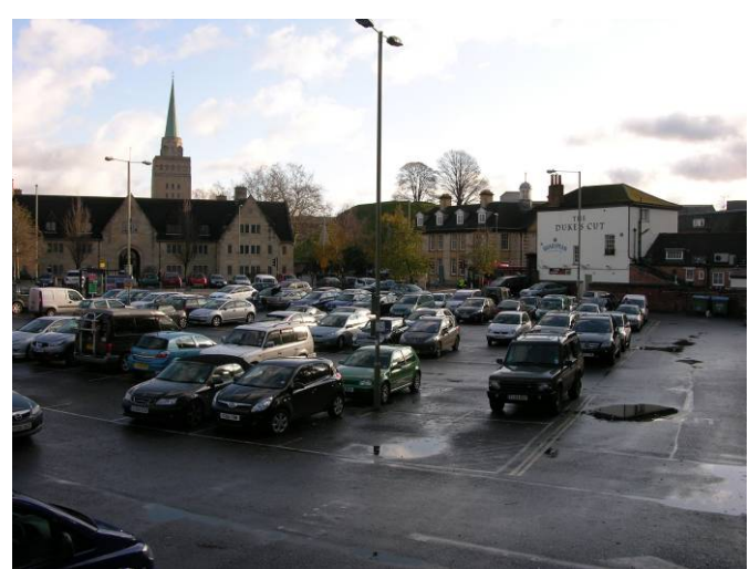
Worcester Street Car Park looking south-east with the Castle Mound in the background.

In the late 18<sup>th</sup> the New Road turnpike route was cut through the castle precinct from Queen Street to the Castle Mill Stream and on westward to Botley, bypassing St Thomas' suburb. The Oxford Canal arrived at Oxford in the 1780s, entering the city from the northwest, parallel to the Castle Mill Stream, before turning east over the former open space towards the now levelled siege mounds next to Bulwarks