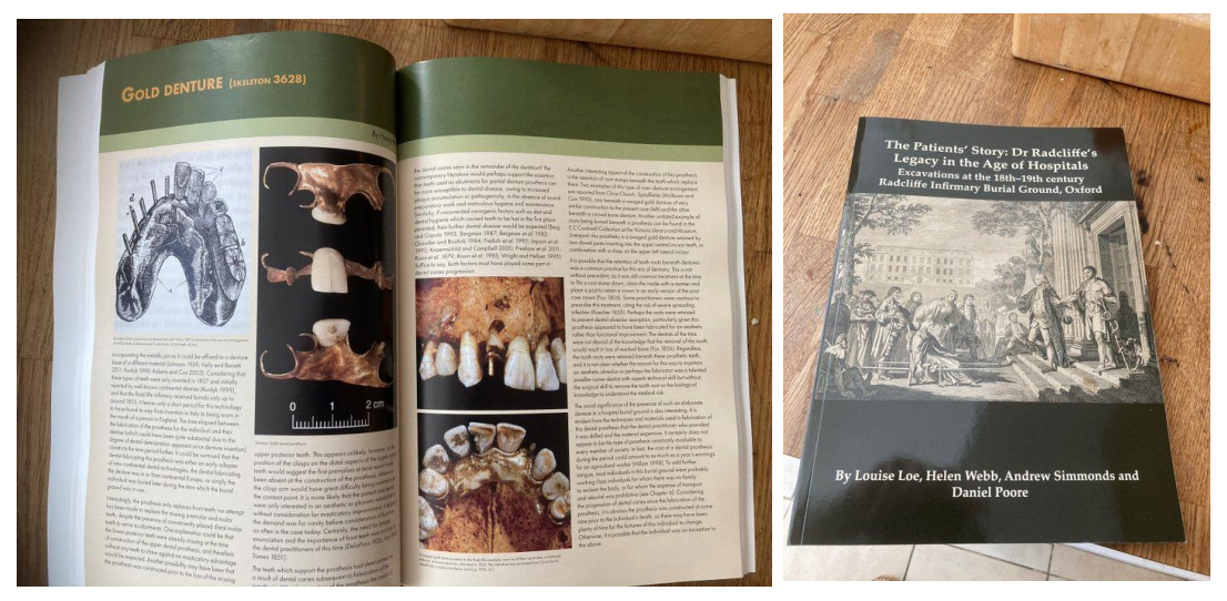
Right: The new Oxford Archaeology monograph of the Radcliffe Infirmary Burial Ground.

I am pleased to report that the Chancellor of the Oxford Diocese has graciously agreed a ten-year extension to the faculty requiring reburial of the remains so that this nationally significant assemblage can be studied further under the curation of Durham University.