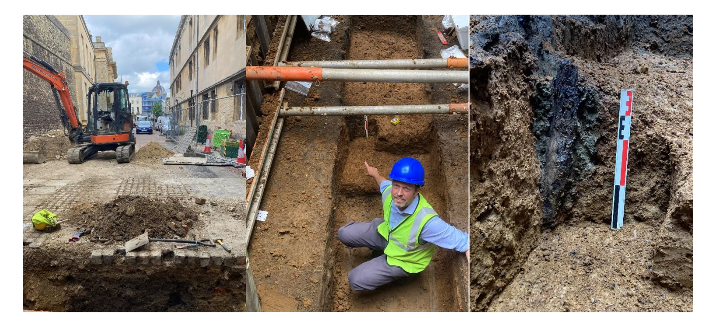
Above left: The line of former Shidyerd Street. Middle: Final reduction through the base of the medieval and likely Late –Saxon street sequence (pointing to the stake - see right). Right: a wooden stake cutting the possible Late-Saxon compacted gravel surface.

In August Oxford Archaeology undertook an excavation on the line of Oriel Street (formerly Shidyerd Street) where it runs between Corpus Christi and Christ Church College. The work sought to obtain a full section through this historic route way which is believed to have been established in the Late Saxon period, potentially as an intra-mural road running along the inside of a rampart belonging to a smaller 'primary' burh (or defended enclosure around the early town). The excavation was logistically challenging because of the very high adjacent precinct wall of Christ Church but was able to successfully record road surface sequences down to an early compacted gravel layer that was covered by a thin organic silt and pierced by a wooden stake. Later medieval pits were found cut into the edge of the road. The hope is that scientific dating may help to establish the date of this early sequence.