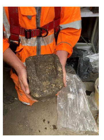
Above, from left: The excavation area within the Castle Bailey ditch. Middle: A post-medieval barrel perched on the edge of the infilled ditch: Right: Pewter cup from the ditch. Below, from left: A piece of medieval moulded stone discarded into the ditch. Middle: Site visit by Oxford Preservation Trust and Tom Hassall, former City Archaeologist, who excavated parts of the bailey ditch in the 1970s. Right: A second piece of moulded medieval stone from the ditch.