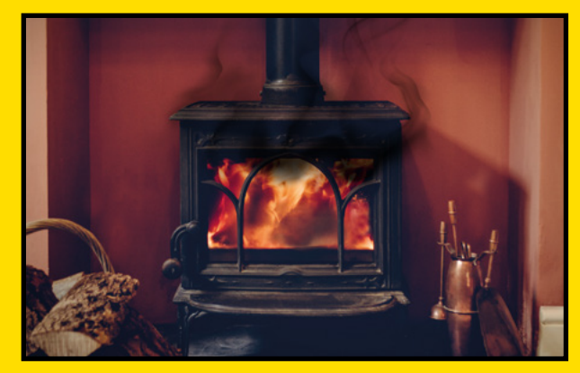
Even efficient wood burning stoves are harmful to your health, your children and members of your local community.