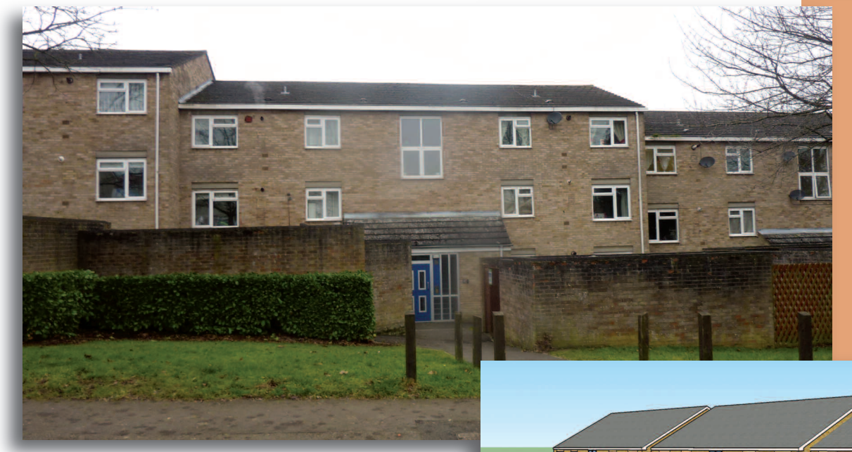
55-89 Bayswater Road