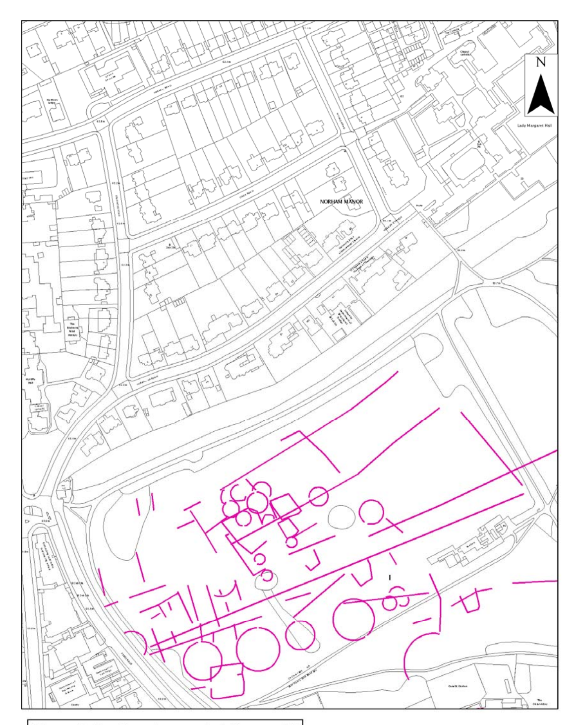
Figure 2: Parchmarks recorded from aerial photographs of University Parks showing a mixture of Late Neolithic - EArly Bronze Age ritual and funerary monuments overlaid with Iron Age and Roman field systems.