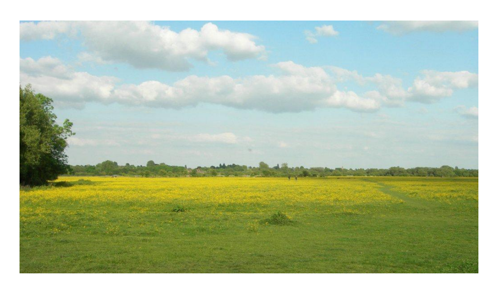
Wolvercote Common at buttercup time in spring, 31st May 2013, photo J Webb.