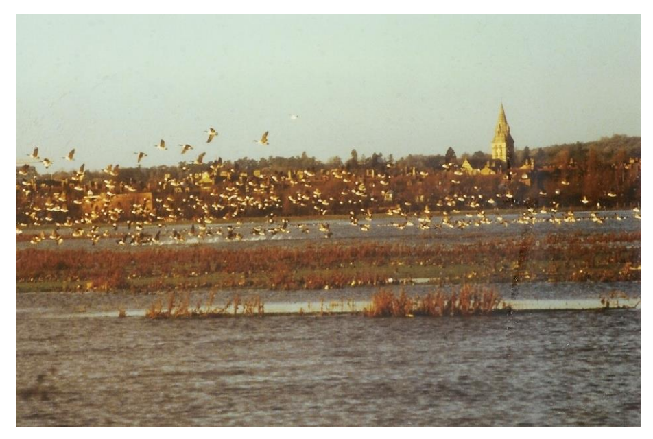
Migrant waders over flooded south end of Port Meadow, 1989

This area is frequently winter-flooded and always summer-grazed. This is mesotrophic grassland with higher nutrient status and it is typical of such situations that no fungal fruiting bodies (caps) are found. On the east side, next to the raised causeway adjacent to Burgess Field, there is a large population of marsh arrow-grass Triglochin palustre and occasional round-fruited rush Juncus compressus and slender spike-rush Eleocharis uniglumis amongst a big population of common spike rush Eleocharis palustris , with silverweed Potentilla anserina and water forget-me-not Myosotis scorpioides , plus occasional creeping jenny Lysimachia nummularia .