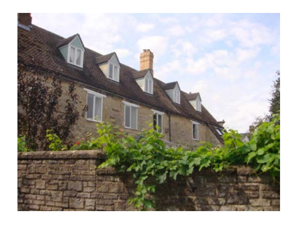
To the east of the lane opposite Beauchamp Place are the first

In this narrow stretch of the lane the first signs of damage to historic paving materials are visible. Recent repairs to paths and kerbs have improved the visual appeal of the area. The failure to replace granite sett gullies detracts from the character of the street and is detrimental to the area as a whole. Damage to the road and paths appears to be caused by a combination of inconsiderate road and utility repairs alongside an excessive traffic movements using the road as a 'rat run'. This damage impinges on the visual character of the area.