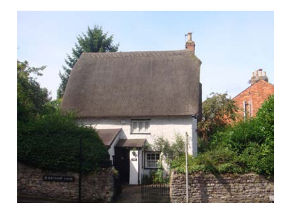
The house is unique within the area in that its thatched roofing has

Access at the northern end of Beauchamp Lane is from the commercial area of Cowley centre on Between Towns Road. Here the juxtaposition between the character of the conservation area and its surroundings is at its most marked. On the western side stands number 1 Beauchamp Lane, a Grade II listed 17th century cottage with whitewashed rubble stone walls.