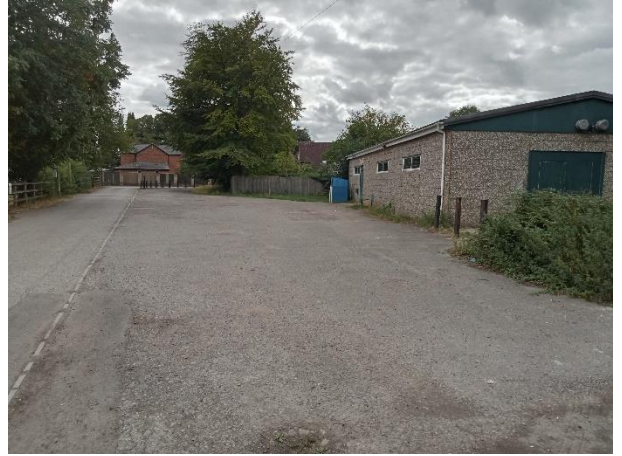
Hardstanding and Scouts building