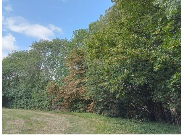
Trees along northern boundary