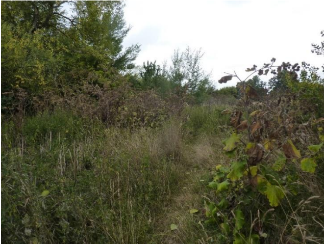
Scrub with grassland path