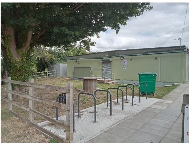
Football Club building