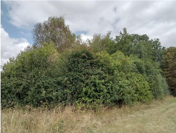
Scrub and trees at TN 1