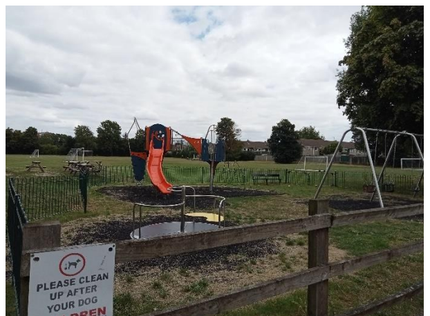
Children's Play Space