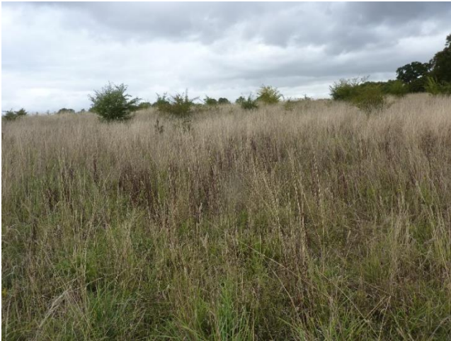
Grassland with scattered scrub