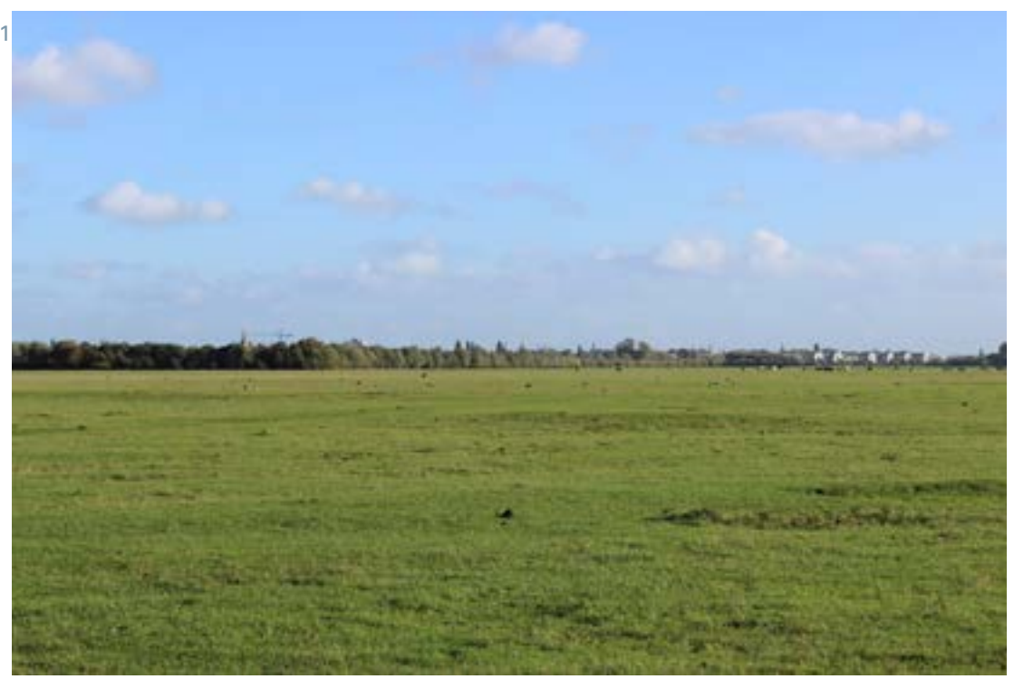
Photograph of the view from Port Meadow