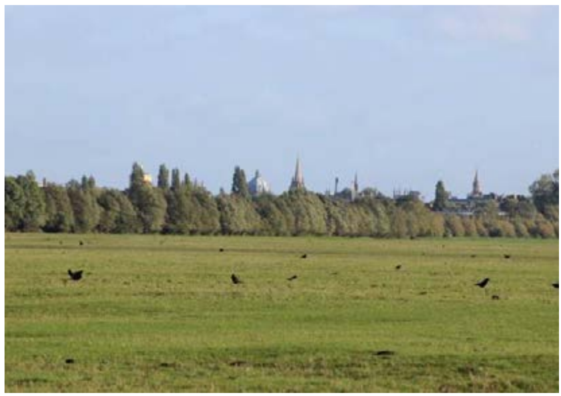
The Port Meadow View September 2013 focused on the core of buildings surrounding Radcliffe Square (compare with photo below for the wider view)

The view is seen by many using the meadows as an open rural space to escape the urban environment of the city. The meadow itself has a high level of archaeological interest, as well as being valued for its attractiveness as an open area of historic countryside with vistas in many directions that are unaffected by modern development. As such, the impact of the recent development of buildings at Roger Dudman Way has proved highly controversial. The meadows are linked wth other viewing places, via the network of footpaths, particularly the river banks at Godstow, Binsey and Medley and Wytham Hill to the west and the bridge over the railway line in Wolvercote to the north east.