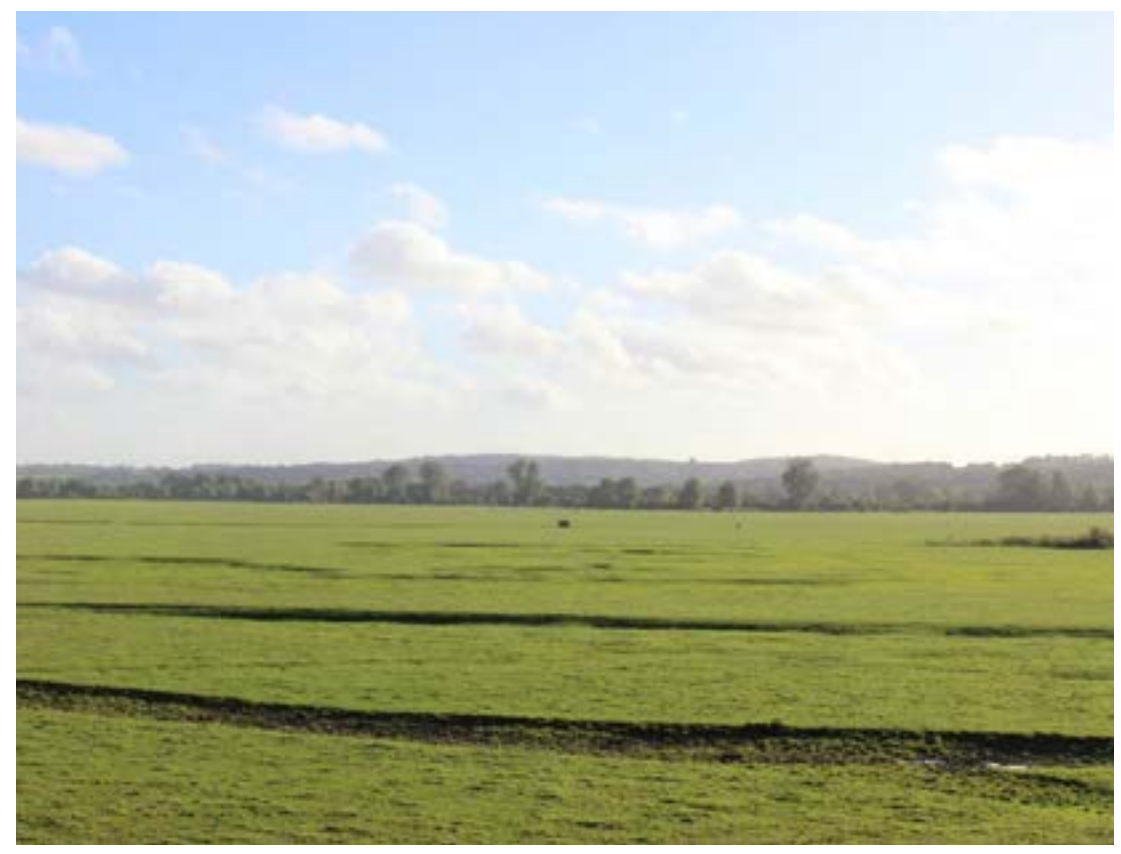
Port Meadow is a landscape that has preserved its character as open common land despite many uses over the past 1000 years