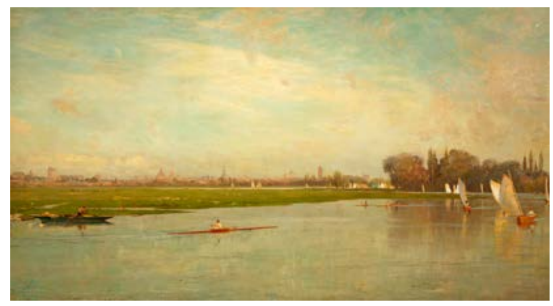
Oxford, Port Meadow from Medley Fields, James Aumonier, 1880