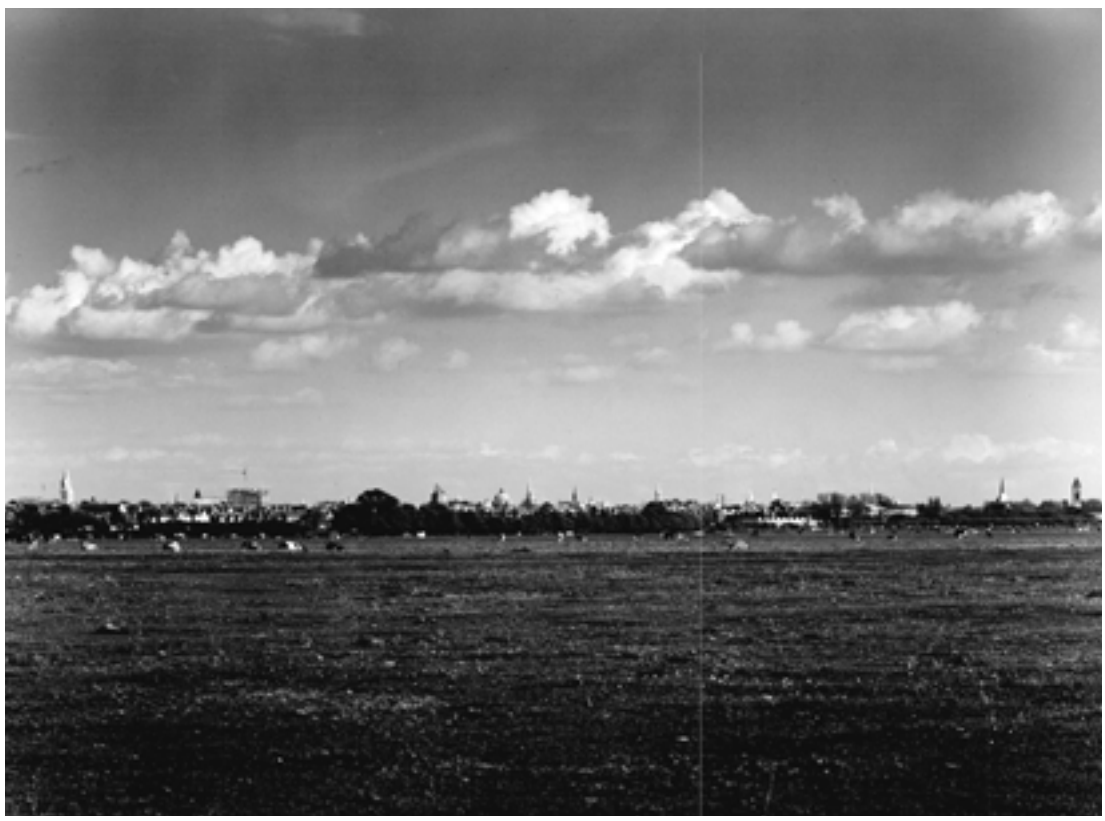
The Port Meadow view in 1962