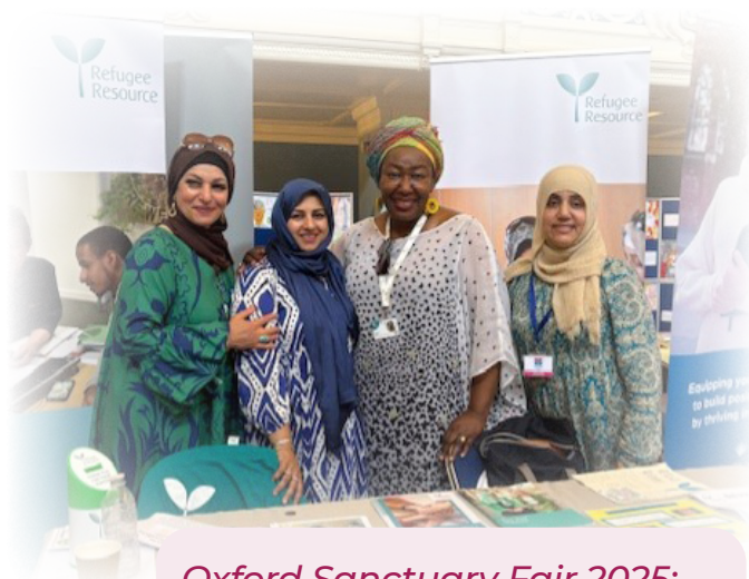
Oxford Sanctuary Fair 2025: Community as a Superpower.

Based on close collaborations with lived experience organisations the Council has been actively involved in providing more inclusive and holistic support for people seeking sanctuary. We are proud to celebrate refugee experiences through Refugee Week celebrations and the annual Sanctuary Fair. So, while we aim to do better with regards to our statutory duty, our overall approach and plan is to go beyond business as usual.