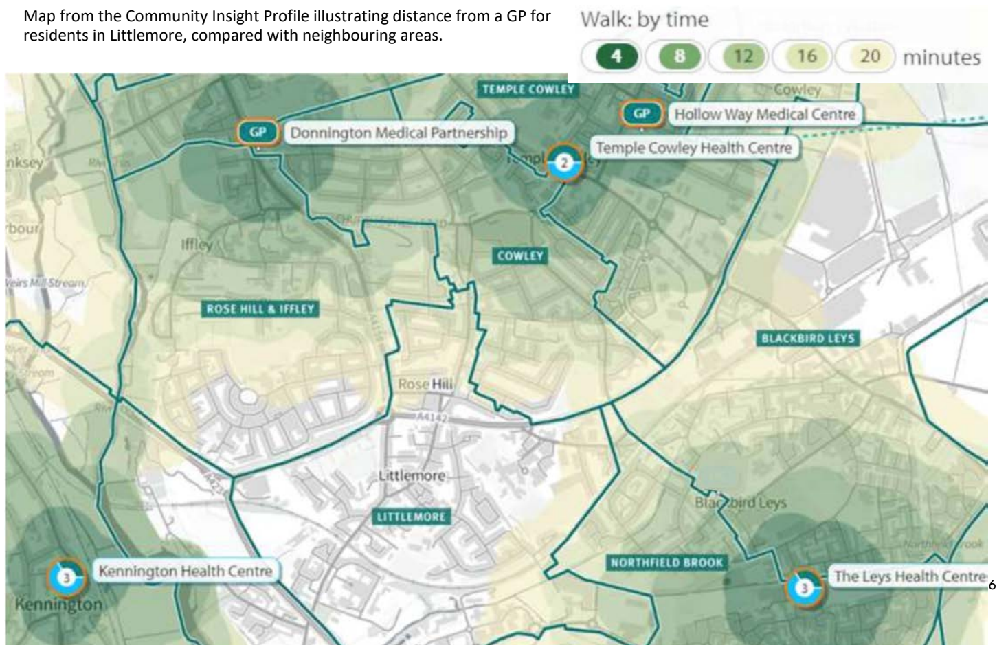
Map from the Community Insight Profile illustrating distance from a GP for residents in Littlemore, compared with neighbouring areas.

It is likely that the area around the Kassam Stadium will be developed during the next few years. Plans for a very significant development, to be called the South Oxfordshire Science Village, of some 3,000 houses, on land south of Grenoble Road (in South Oxfordshire), are under discussion. If approved, these will be very substantial developments affecting Littlemore. It is planned that the Cowley Branch line will re-open to passenger traffic, subject to the necessary funding being available. It seems certain that, in the next 15 years, Littlemore and the surrounding areas will continue to change, and this Plan is intended to try and ensure that Littlemore is, and remains, a good neighbourhood to live and work in.