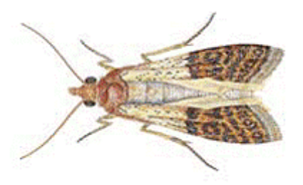
Indian Meal Moth