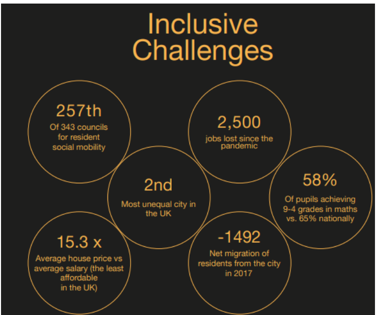
Figure 1: Inclusivity Challenges for Oxford

2.8 Oxford's Economic Strategy has three key themes. Zero Carbon, Global Impact and the Inclusive Economy. The Strategy highlights the following key challenges for the city in relation to Inclusivity: