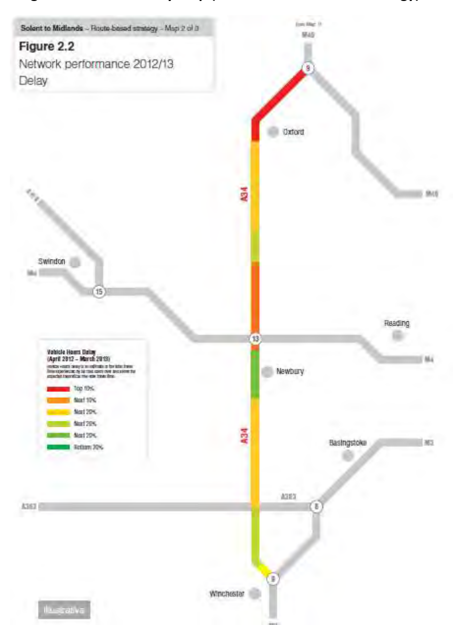
Fig 1. A34 Vehicle Delay Map (From HA Route Based Strategy)

solutions some of which are suitable for funding through the Local Growth Fund and long-term solutions undertaken under the Highways Agency's (HA) funding allocation of £15billion for 2015-2021.