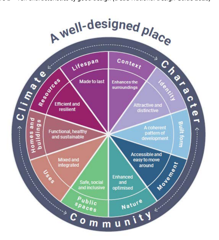
Figure 1 – Ten characteristics of good design (DCLG National Design Guide 2021)

The National Design Guide<sup>1</sup> is a material consideration and forms part of national planning guidance setting out the characteristics of well-designed places and demonstrating what the government considers good design to mean in practice. The guide outlines and illustrates ten characteristics of good design falling under the topics of Climate, Character and Community. The characteristics range from context, identity and built form, through to nature, public space, movement, and the uses on the site including homes and buildings, the resources used to construct them and their life span. Each is discussed in detail in the guide but are illustrated in the circular diagram in Figure XX, over the page.