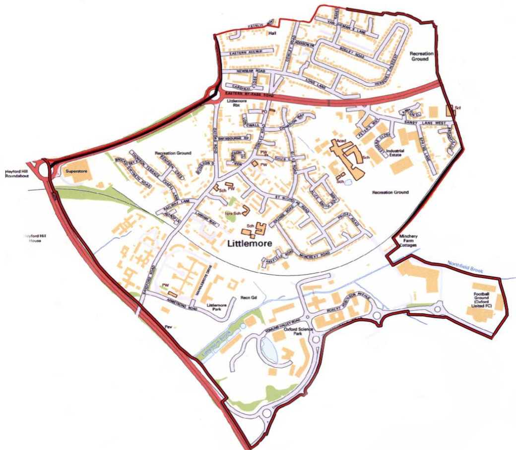
Fig. 1 Littlemore Parish Boundary (circa 2011)

In 2011 Littlemore ward had 6,278 residents living in 2,694 households. Littlemore also had 163 residents who were living in communal establishments such as hospitals or care homes. The household population grew at 13% in the decade 2001-2011, slightly above the Oxford average, and the number of households increased by 237 (source 2011 census).