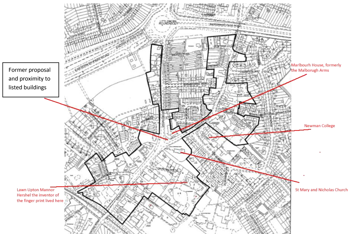
Above: depicts the Littlemore Conservation area (Black bold line), the proposal is located in a central position on a wide verge where residents have held Christmas carols, and serves as the geographic and visual centre of Littlemore.

There are several listed buildings in the vicinity of the project.