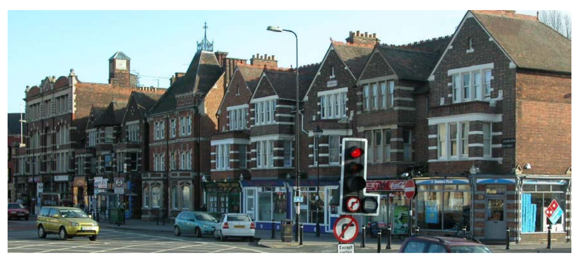
Buildings forming the south side of Frideswide's Square

Initially the heritage assets register will cover four trial areas of the city (shown on the proposed study map, including East Oxford (St Clement's, St Mary's and Iffley Fields Wards) Summertown district centre and environs, West Oxford (including parts of Carfax and Jericho and Osney Wards) and Blackbird Leys (Please see the map showing the locations of the four study areas). The Council hope to have prepared a list of candidate heritage assets for East Oxford as a pilot study by late Spring 2012. At a later stage it is hoped that this register can be expanded to cover other areas of the city.