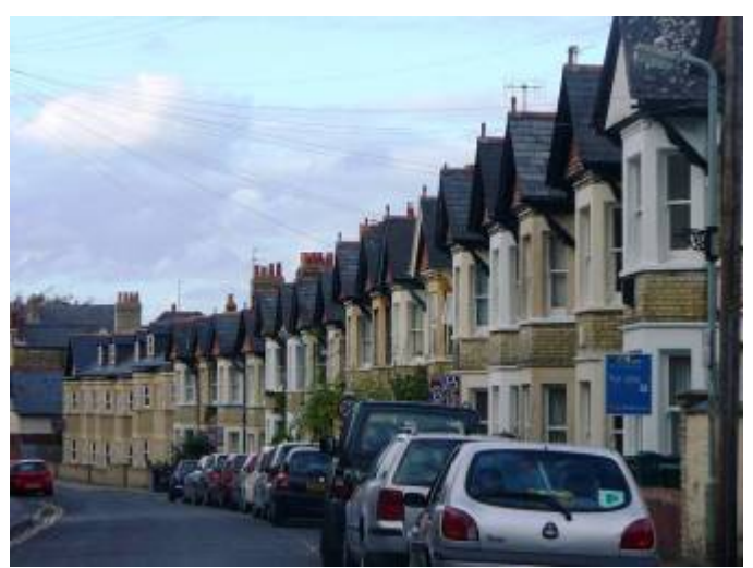
Oxford contains areas and buildings that might not meet the national criteria for statutory designations but are still valued locally for their historic interest.

This description suggests a wide range of landscape or townscape elements might qualify as heritage assets. They include the nationally and locally designated heritage assets of Scheduled Monuments (archaeological sites), Listed Buildings, Registered Parks and Gardens and Registered Battlefields, which are protected by law and are selected by English Heritage according to criteria that ensure they are of national significance. Conservation Areas are designated as heritage assets by the City Council but are also protected by law and selected according to nationally determined criteria.