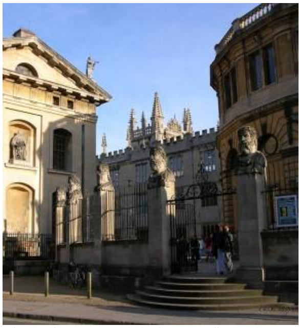
The familiar image of Oxford's nationally significant heritage assets.

The city also includes residential areas, public parks and district centres with historic buildings and open spaces that have an identity and character that are valued locally and that are locally significant for their historic, architectural, artistic or archaeological interest. For these features to be given appropriate consideration by planners and others their significance needs to be identified and understood at an early stage.