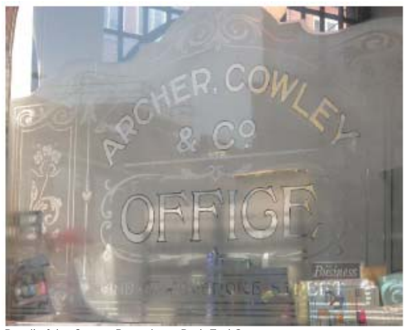
Detail of the Cantay Depository, Park End Street

Residents will prepare character statements that highlight the key features of the local historic environment of each area, which will then be used to identify the heritage assets for the register. The character statements will also provide a more general evidence base that identifies the value of