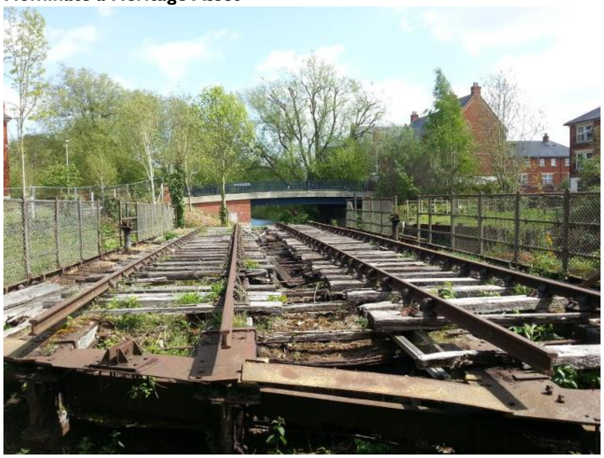
Swing Bridge Heritage Asset – Looking east along Rewley Abbey Stream to the Canal