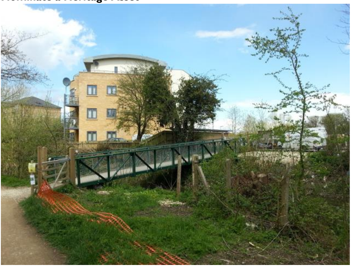
Current Development – Screening still possible – note satellite dish