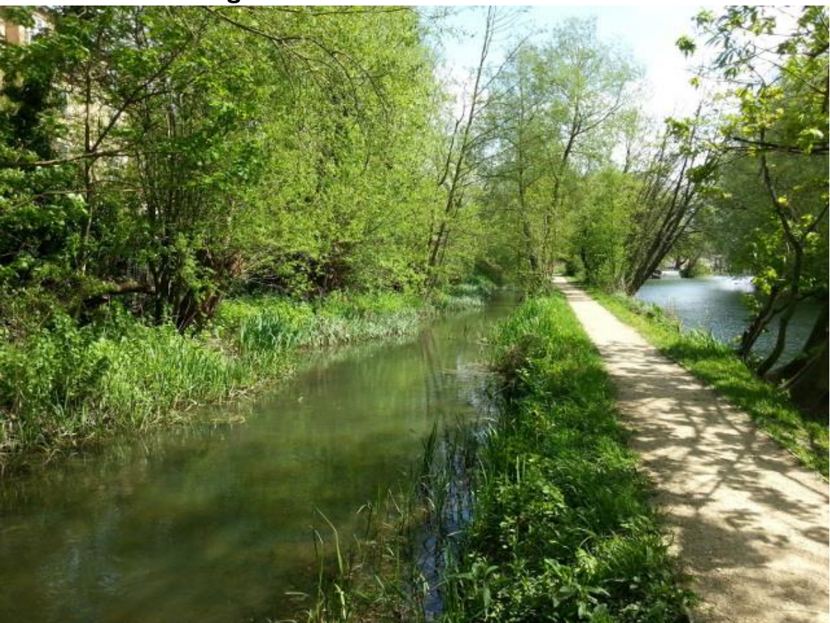
Fiddler's Stream 20m north of development site looking south