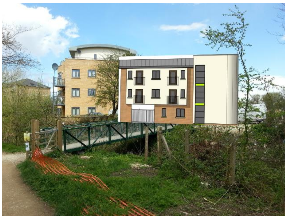
Unmeasured attempt to visualize new development based on submitted plans