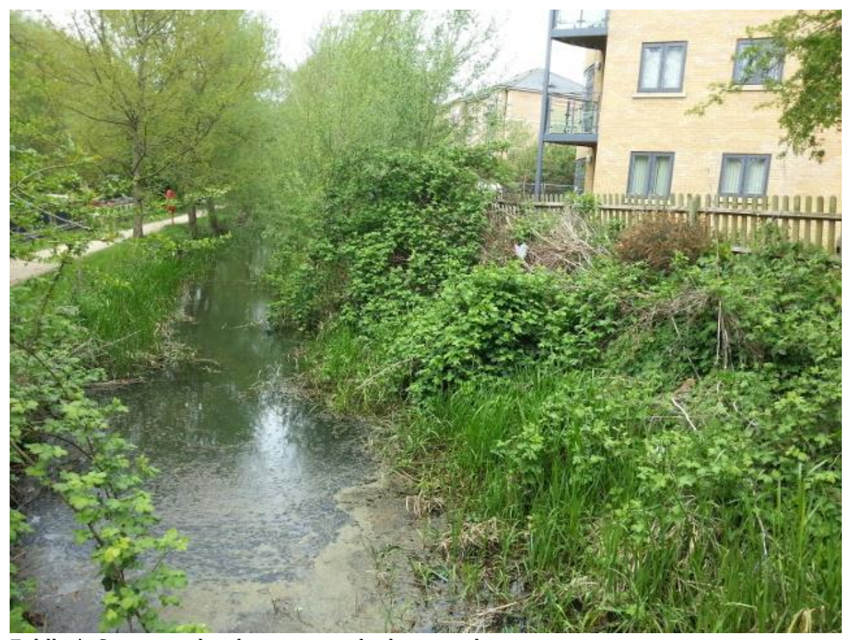
Fiddler's Stream at development site looking north

Fiddler's Island Streams, as distinct from the Thames, provide a very narrow band of habitat on the east side, connecting Port Meadow to areas downstream.