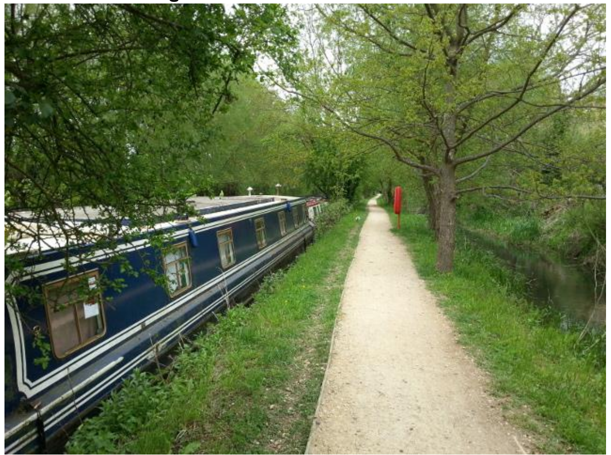
Approaching Port Meadow looking north