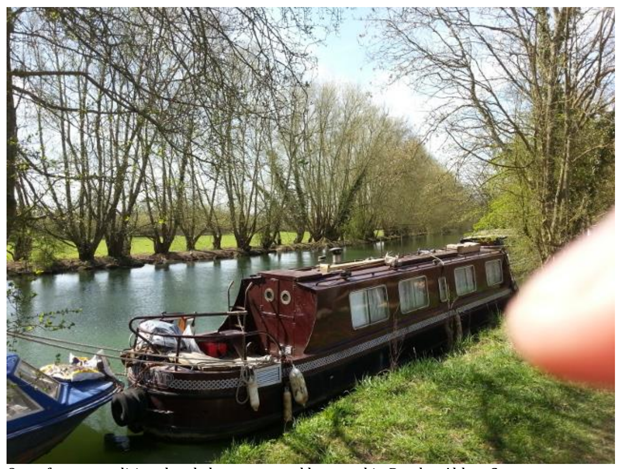
One of many traditional style boats moored here and in Rewley Abbey Stream

The presence of narrow boats moored along the banks of the Thames and Fiddler's Island is an important reminder of an 18^{\rm th} century heritage.