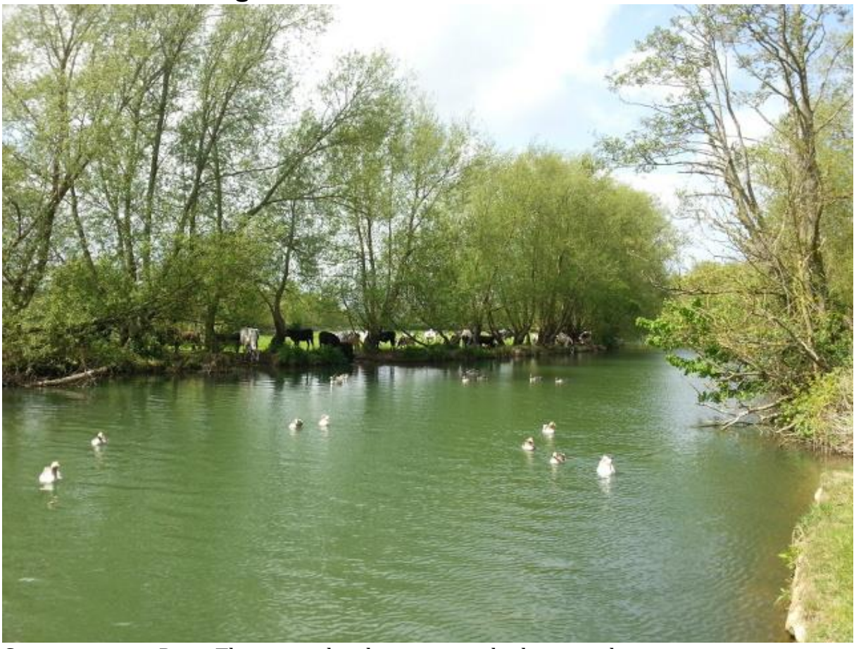
Cows grazing at River Thames at development site looking north-east