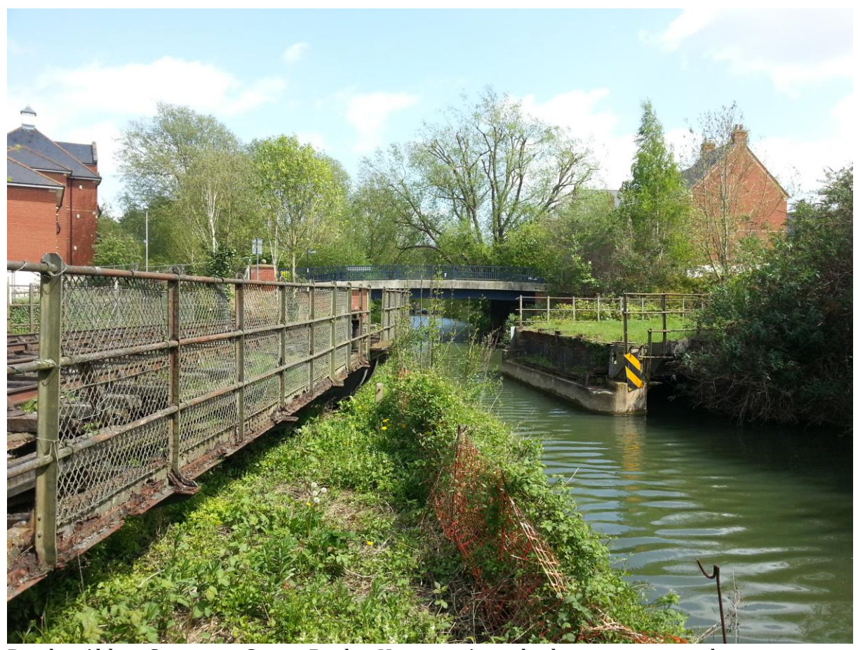
Rewley Abbey Stream at Swing Bridge Heritage Asset looking east to canal