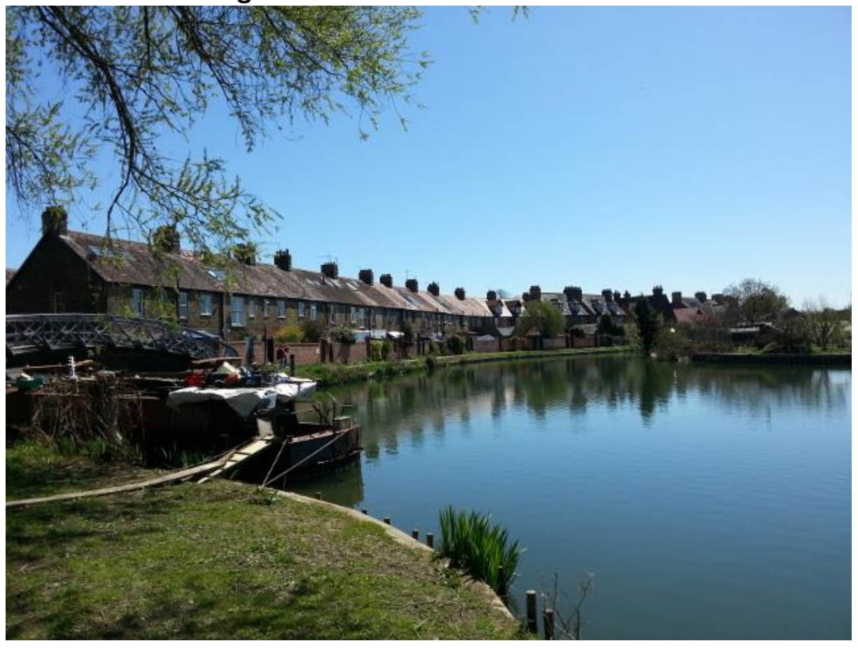
Complete Victorian terracing with allotments south to Osney Bridge, Rewley Abbey Stream to left