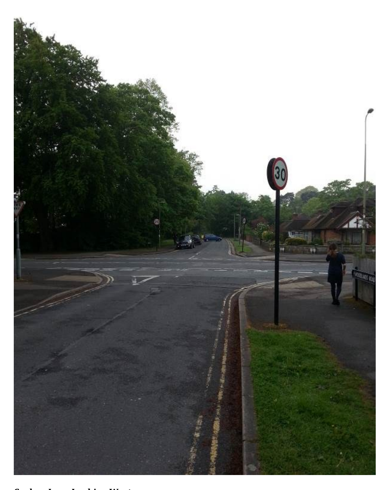
Cuckoo Lane Looking West