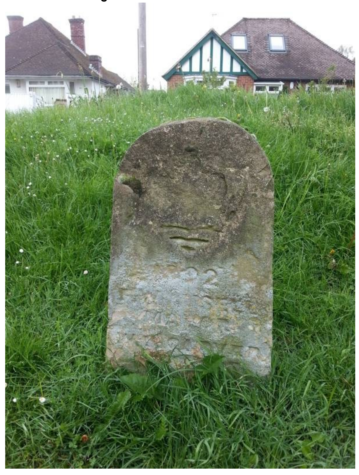
Nominated Boundary Stone: In Nominated Area