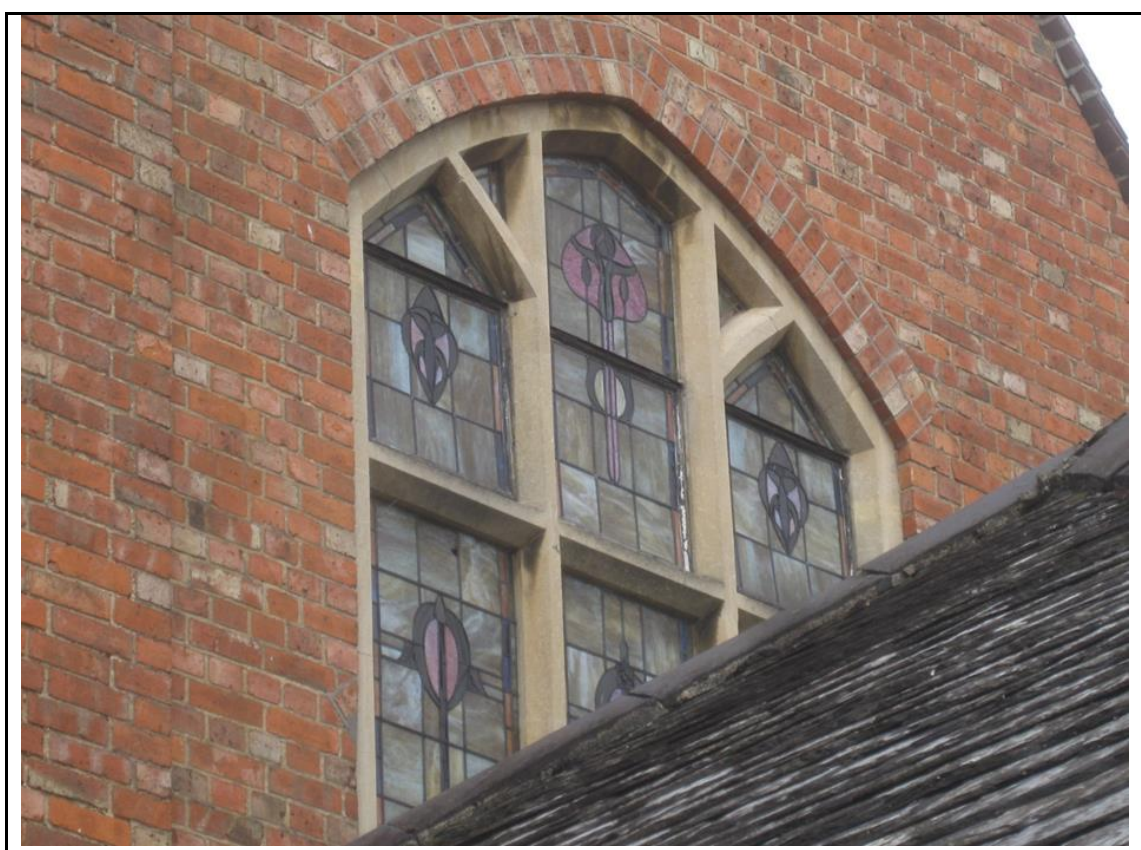
Art Nouveau stained glass window to East End