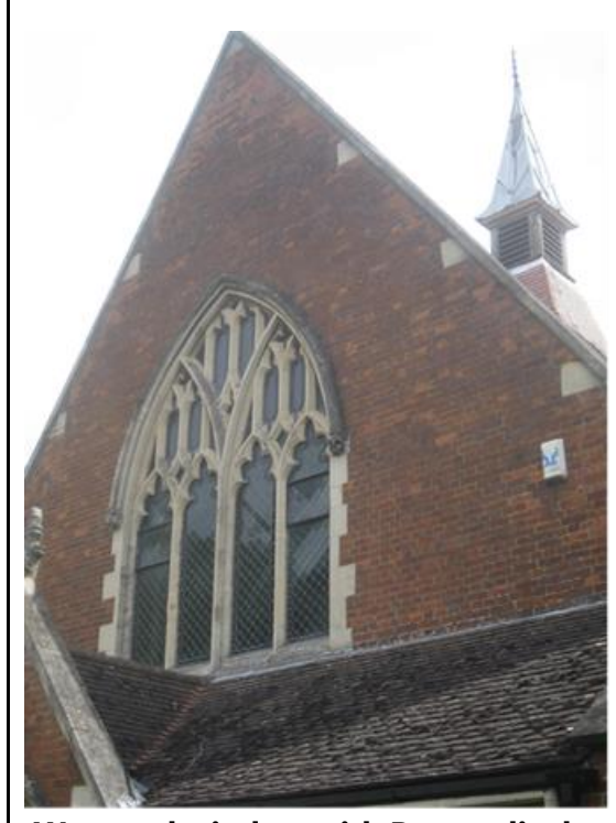
West end window with Perpendicular stone tracery