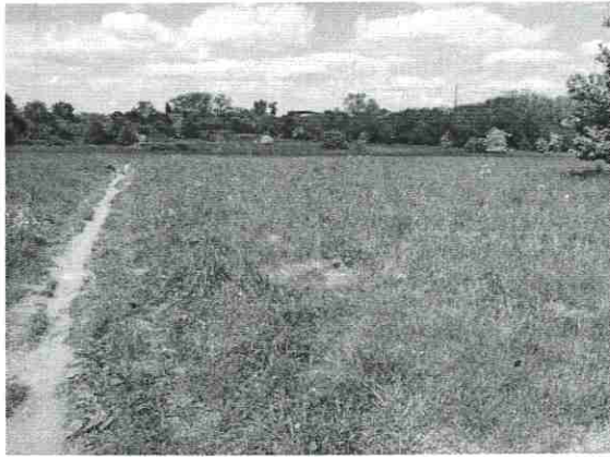
Warneford Meadow looking north

Name and location of your candidate heritage asset (please provide a photograph and a map showing its location): Warneford Meadow, OX3 / OX4 (GR 540060)