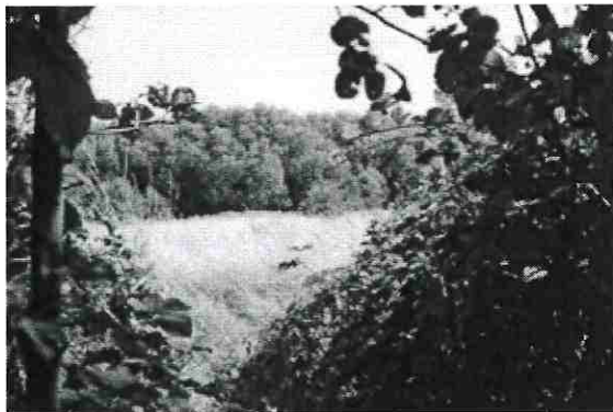
Warneford Meadow looking east