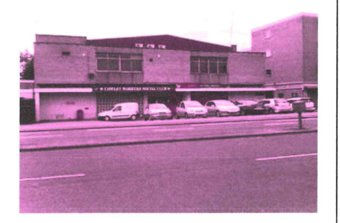
Image of Cowley Workers Sports & Social Club, looking on from Saint Lukes Road.