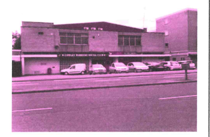
Image of Cowley Workers Sports & Social Club, looking on from Saint Lukes Road.