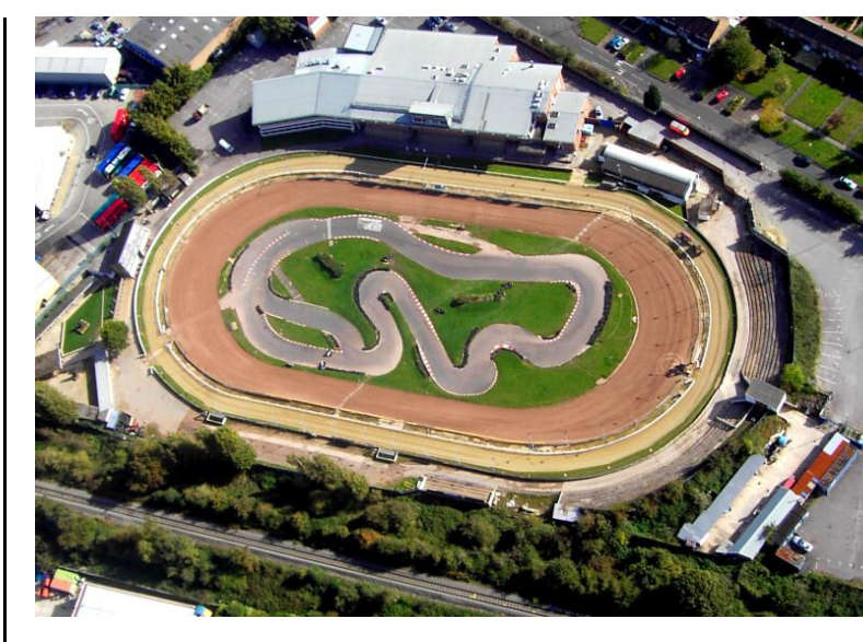
An aerial view of Oxford Stadium