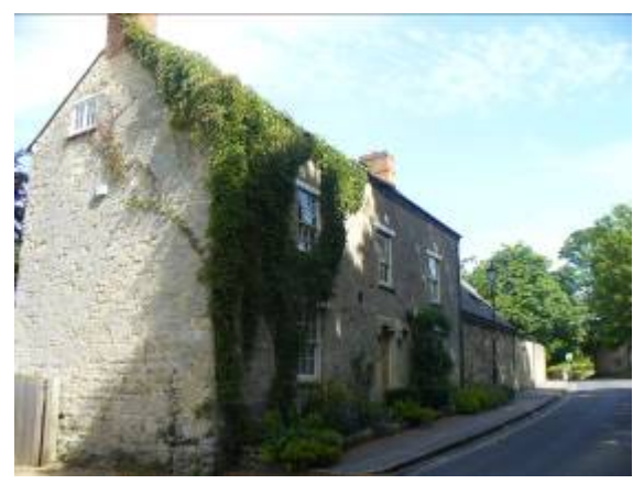
Lower Farm (No. 8 Dunstan Road), built around 1800 is a late addition to the group of vernacular farmhouses and cottages

and the booming university town as from agriculture.