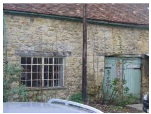
Details of the barn doors and windows at Bury Knowle