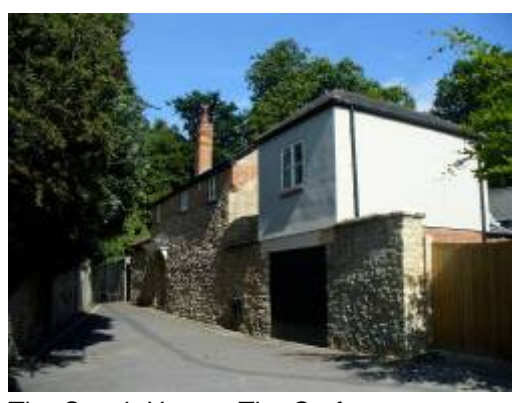
The Coach House, The Croft

Houses throughout the area are of a consistent low scale, rarely of more than two stories, whilst the cottages at Nos. 9, 11 and 11a The Croft are a group of single storey cottages with additional attic rooms lit by dormer windows. The character of individual materials throughout this area, such as the distinctive colouring and texture of both the locally produced handmade brick of the early 19<sup>th</sup> century and the later 19<sup>th</sup> century wire-cut bricks is immediately appreciated due to their proximity to the pedestrian.