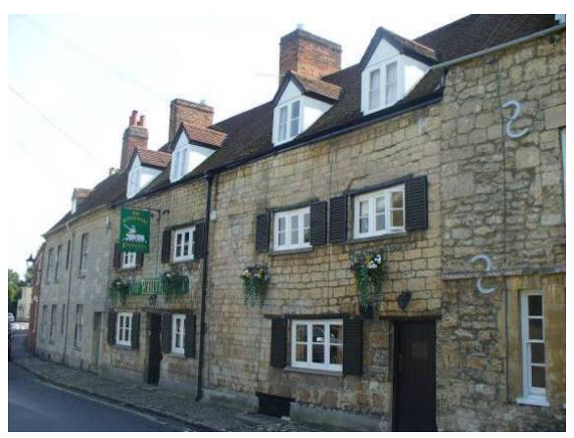
The White Hart Inn, St Andrew's Road

These new buildings and the 1605 map of Headington demonstrate the existence of both Larkin's Lane and St Andrew's Lane in the early 17<sup>th</sup> century. The 1605 map reveals that a 'common well', located on the spring-line approximately 150 metres north of St Andrew's Road, was the destination of both routes, which must have been an important resource to the community and particularly to cottage dwellers who may not have had their own wells. The map also shows one of the college's properties located on St Andrew's Road, with a yard behind and a separate garden just to the south, forming the pattern still preserved in the frontage buildings at St Andrew's Road, with the gardens at the rear as preserved adjacent to No. 17 The Croft. A road named Oxford Way is shown following the modern alignment of Cuckoo Lane and running up to Old High Street. This was the main route from Oxford to Headington until the later 18<sup>th</sup> century. A northerly branch of this road ran up to the western end of St