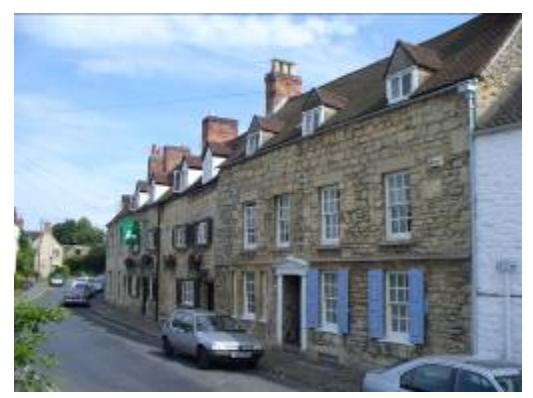
View along the St Andrew's Road frontage

attractive group of cottages at Nos. 8 – 11a The Croft, is of particular note and must be truly picturesque in high summer, when the small cottage gardens are full of flowers.