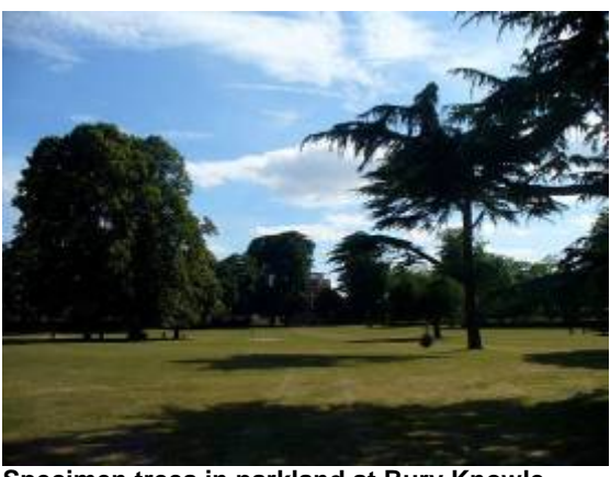
Specimen trees in parkland at Bury Knowle Park

Modern additions to the public parkland include references to Headington's literary heritage and, particularly to C.S. Lewis' children's stories. These include the Storybook Tree, and the surrounding benches, which depict animals that feature in the Chronicles of Narnia, as well as the 'Peace Sculpture' of 12 decorated slabs set in the grass, each provided by one of Headington's schools. The large children's playground, enclosed by a low beech hedge, provides another resource for families with small children in the park.