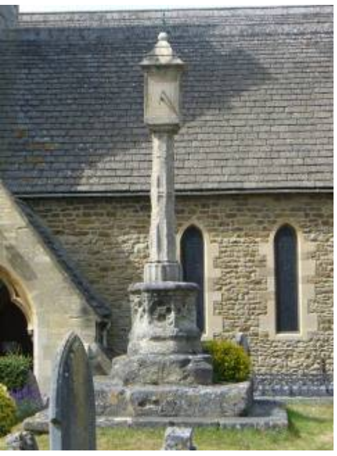
The village's medieval cross in the St Andrew's churchyard

The mid-12<sup>th</sup> century village of Headington, next to its stone church, would have stood at the centre of an extensive agricultural landscape of open arable fields lying to the east, south and west. A smaller amount of pasture land was located directly to the north of the village and must have been a closely guarded resource, used for both livestock and draught animals (see the Green Fields Character Area, below). A main street along the line of St Andrew's Road would have lain just above the spring line. The boundaries of a series of tenements running along the south side of St Andrew's Road are suggested by the plots of the modern land holdings, which run back from the street frontage around long gardens that end at a lane (The Croft) that probably provided access to small agricultural buildings on their southern boundaries. Beyond this lane the plots continued as long narrow gardens that ended at the edge of the open field. Larger properties were clustered around the main street as discrete farm units.