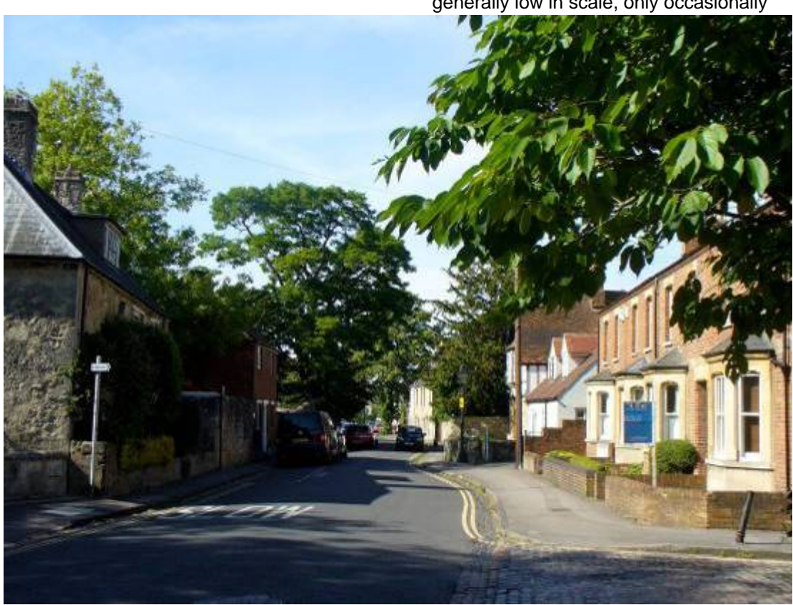
View north at Old High Street

This area contains the central streets of the historic village, with long and gently sinuous paths and a strong sense of enclosure provided by closely spaced or informally terraced buildings built at the back of pavement, behind small front gardens or with high garden walls of local limestone to the road. This area contains the focus of the seventeenth and eighteenth century houses, cottages, inns and farmsteads as well as the medieval core of the village around the parish church of St Andrew. It has a quiet, residential character, with only four nonresidential buildings (two churches and two public houses), although it preserves the evidence of shops and businesses that reflects the historic village as an independent community. Buildings are generally low in scale, only occasionally