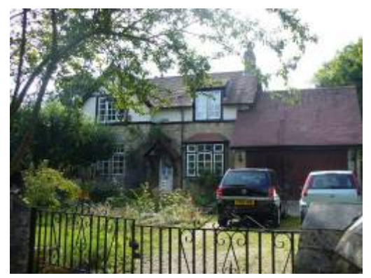
No. 6 The Croft

There is little or no differentiation between the surfaces for motor vehicles, pedestrians or cyclists, except where bollards restrict access to vehicles. The amenity and safety of this environment for pedestrians and cyclists is dependent on the maintenance of minimal traffic movement. It was pointed out during public consultation that this is still an area where children can play in the street. The numerous points of access, including routes through Laurel Farm, from Osler Road, St Andrew's Road and Old High Street, and the position on the routes to shopping areas on London Road or the public facilities at Bury Knowle, means that this area is popular with and very well used by pedestrians. The lack of traffic movement and noise also provides a distinct air of tranquillity, highlighted, on occasion, by the sound of the bell ringing at St Andrew's church (including the regular Tuesday night practice) or singing at the Baptist Church.