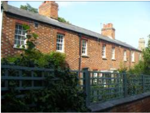
Nos. 2 – 5 The Croft

The 19<sup>th</sup> century also introduced a cohort of brick-built houses, some of which contribute to the locally distinctive use of handmade Shotover bricks laid in Flemish bond with blue or 'dust-brick' headers forming a decorative chequer-work pattern. These include Nos. 16 The Croft, 35 St Andrew's Road and Nos. 2 - 5 The Croft, which have idiosyncratic features of design and fenestration that set them apart from mid and later 19<sup>th</sup> century brick cottages built to more widely represented designs. Examples of the latter are seen in the village and reflect the encroachment of speculative development into the village in marginal areas such as The Croft, St Andrew's Lane and the western limit of St Andrew's Road and in larger groups on Old High Street.