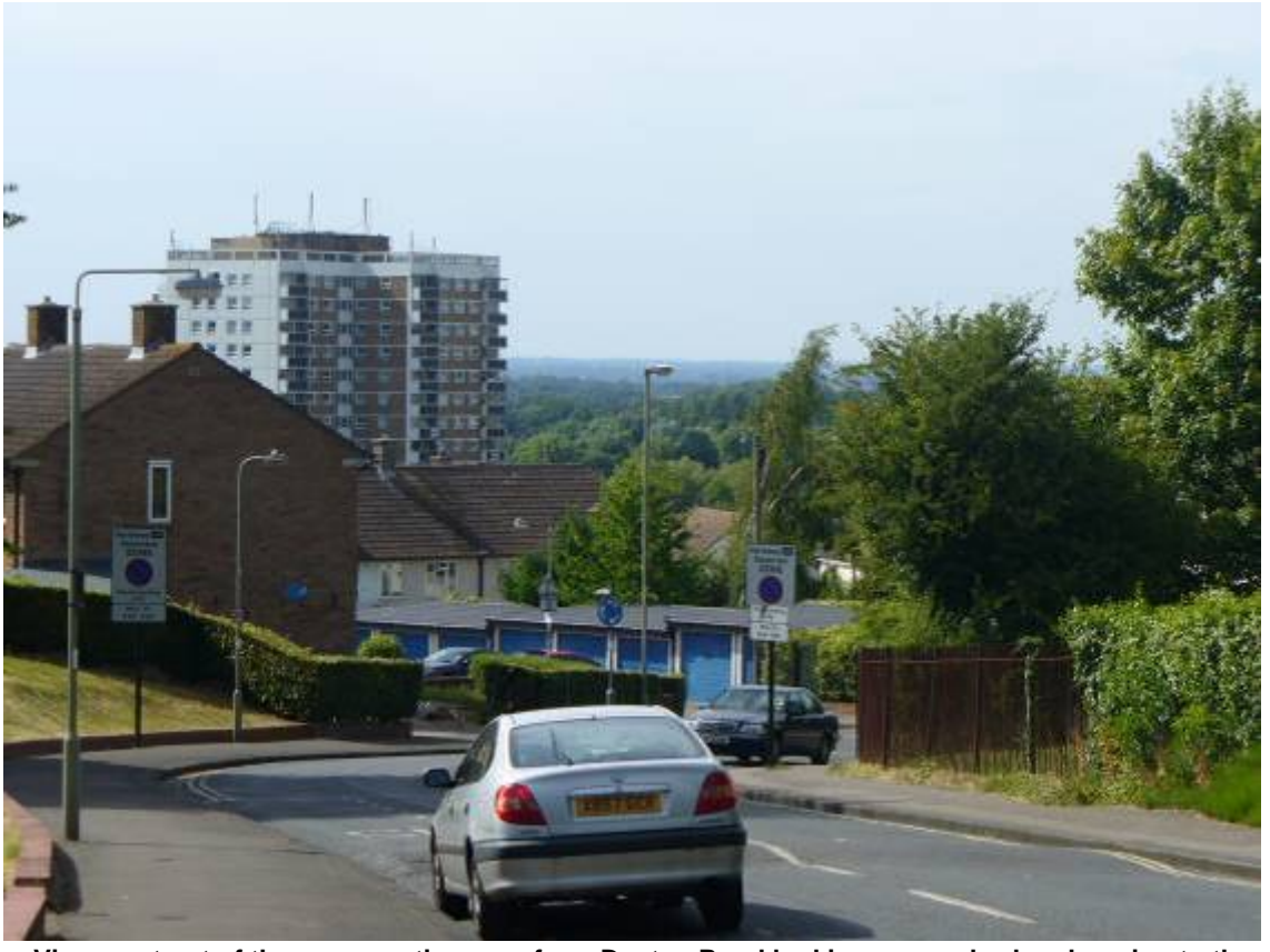
View west out of the conservation area from Dustan Road looking over suburban housing to the Cherwell and Thames Valleys

The limestone of Headington Hill gave rise to well drained soils that would have been easily cultivated and much of this area was arable land in the open fields of Headington until enclosure at the