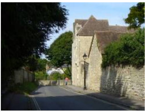
View north at Osler Road, including St Andrew's House

channel views along the road. None of these buildings address the street directly, with entrances on other streets or through gardens. They are well spaced in large plots and rise up to three stories at the Old Pound House and St Andrew's House. However, they are of a more domestic scale than the mansions to the south. The break in the line of vision along Osler Road, increased enclosure of the road and change in scale and spacing of the buildings provides a comfortable transition in character between the larger properties and formal landscapes to the south and the densely built-up village core to the north.