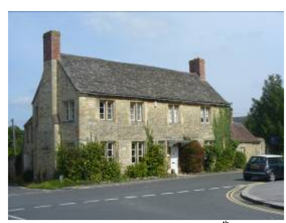
Mather's Farmhouse, dating from the 17<sup>th</sup> century, forms a landmark at a focal point in the conservation area.

(No. 12). In the former this appears to be an original feature and, as a result, the front door to the building is located at the right hand extremity of the frontage with narrow windows lighting the area of the frontage in line with the chimney. At the White Hart, the main façade of the building was refronted in two sections suggesting it was divided into two properties at one time, with the central chimneystack rising between the two halves.