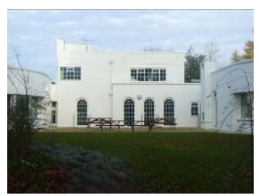
William Osler House, The John Radcliffe Hospital

Of the early 20<sup>th</sup> century houses in the conservation area, a few stand out as particularly interesting. Between 1912 and 1925 The Hermitage (No. 69 Old High Street) was developed from a part of the former maltings into an attractive Georgian style house by a former keeper of Fine Art at the Ashmolean Museum. The conversion is convincing and anyone would be forgiven for thinking the building to be at least a hundred years earlier in origin than it actually is. William Osler House, recently substantially extended, is quite different and provides the village's only example of the white rendered modernist style. It was designed by Stanley Hamp in 1931 for the administrator of the developing Radcliffe Infirmary premises at Headington. It is now used as teaching facilities for the hospital.