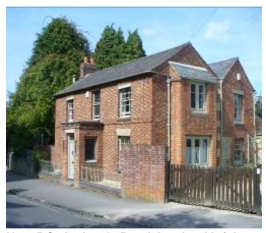
No. 35 St Andrew's Road, local red brick laid in Flemish bond

Brick: In the early 19th century the use of brick to provide, at least, the most visible facades of buildings reflects the adoption of this material as a high status material. These buildings are not uniform however and provide different styles of construction that reflect the status and prestige of their builders. The neighbouring properties at Nos. 1 and 3 St Andrew's Road have a main façade of brick, with smooth surfaced Bath stone dressings to windows jambs, lintels, quoins and a stringcourse over the ground floor. No. 35 St Andrew's Road has a brick stringcourse over the ground floor with brick sills to windows and rusticated stone lintels. No. 16 The Croft is a humbler building, originally two cottages, with significantly less architectural decoration, although the use of gauged brickwork for flattened arches to the window and door openings provides a sense of pride in construction. The terrace of small cottages at Nos. 2 - 5 The Croft provide the lowest status properties in this group and were presumably workers houses for one of the villa estates. Although they are simple buildings, they still have carefully crafted gauged-brick arches to the door and window openings.