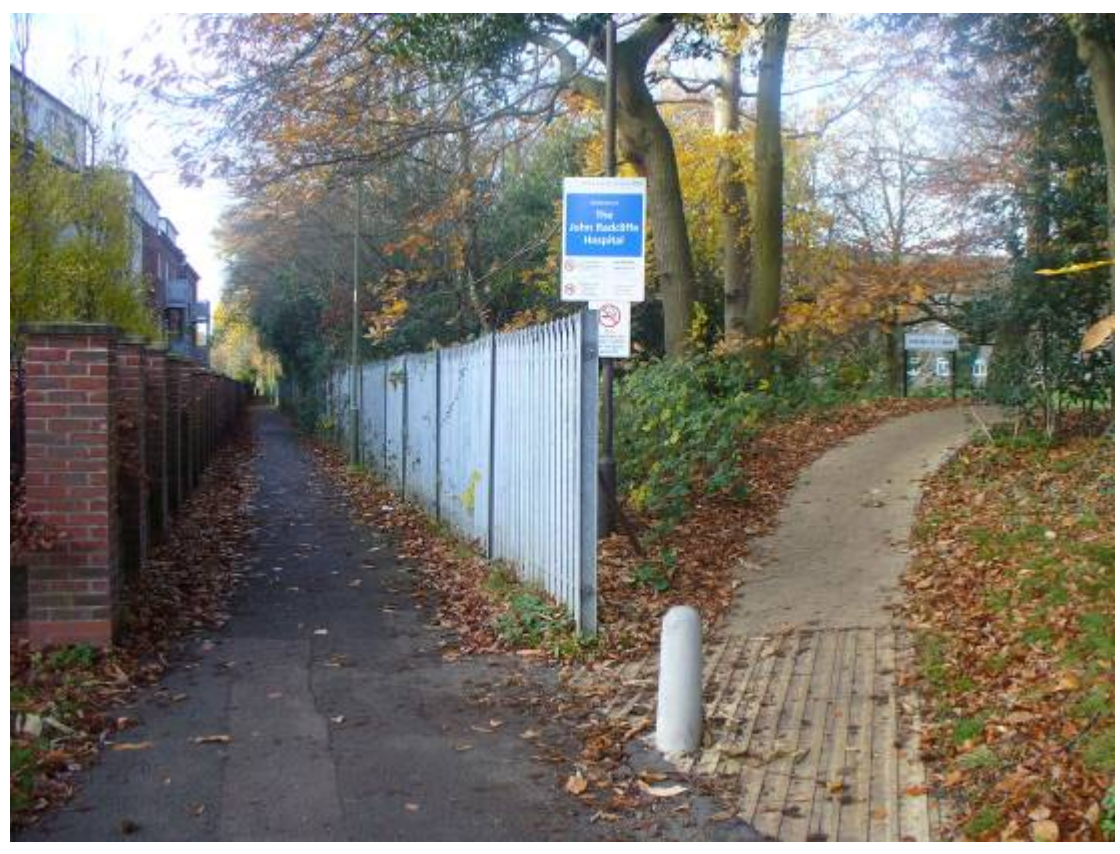
View west at Cuckoo Lane

Between Old High Street and Osler Road the course of the footpath was straightened in the 19th century and excavated to run below the ground level of the gardens and parkland of Headington House. This would have allowed the owners of the house to view their estate, including the parkland south of Cuckoo Lane (which has now been developed over), without having to see passing travellers in their vista. The path's sunken course, which is now accentuated by overhanging trees and the fences of adjacent properties, provides visible evidence of the power of these wealthy landowners over the landscape surrounding them in the late 18th and 19th