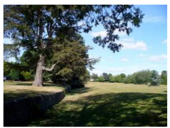
The ha-ha at Bury Knowle Park

Views across the parkland in the south and east are particularly attractive as a result of the combined elements of the wide, green open space, its historic settings, which includes including the park walls and surrounding buildings such as the village school and post-office on the south side of London Road), and the mature tree planting. Historically significant trees include specimen trees, planted to ornament the parkland, trees lining the boundary with London Road, which act as a screen to views from the street and an avenue running along the western edge of the park, which marks the former carriage drive to the house from gates on London Road. More recent tree planting in the park has included the small arboretum in the east, which replaced hockey pitches, as well as a second avenue running along the path following the eastern park boundary.