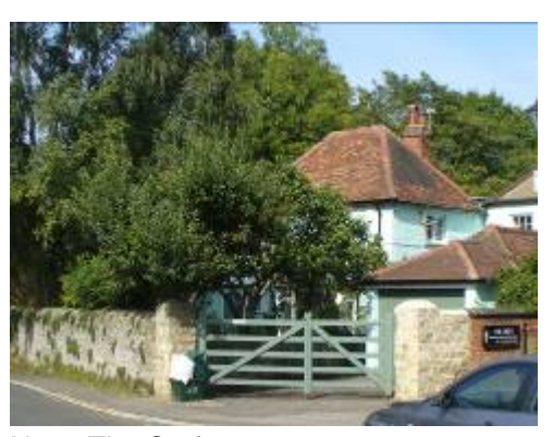
No. 1 The Croft

would have run around. This may suggest it was removed from the estate when it was subdivided. Alternatively it may have stood within the grounds of Headington Manor, at one corner of its kitchen gardens but was later cut off by a rerouting of Cuckoo Lane to the course of Osler Road.