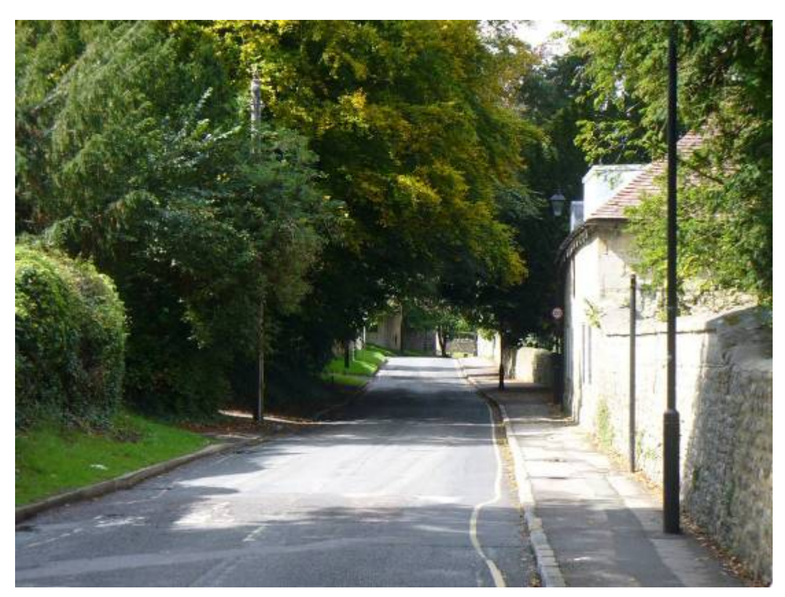
View west along Dunstan Road