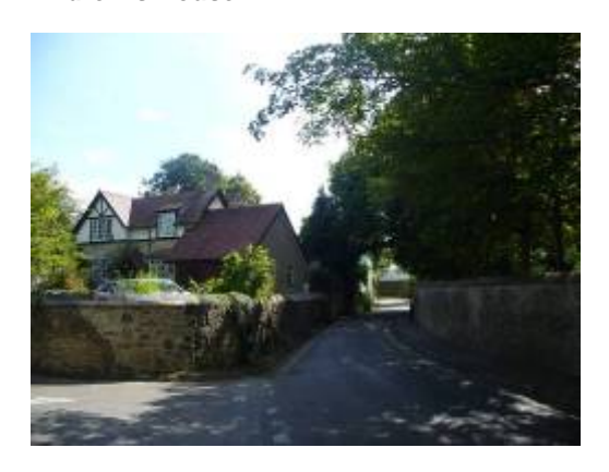
View west at Osler Road, including No. 6 The Croft