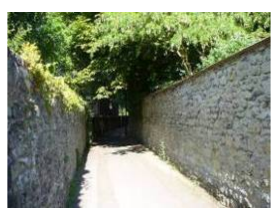
High walls of limestone rubble are a distinctive feature in the conservation area

The bed-rock beneath the village is made up of Lower Corallian beds of sands and grits interspersed with layers of limestone rubble, which provides a long-lived building material as roughly coursed walling, for which it has been used throughout the village. However, it is not suitable for finer masonry. Quarries to the south east of the village provide access to the Upper Corallian series, which include the Headington Hardstone, used for building plinths and kerbs, as well as the softer freestone. The latter was prized for more intricate work and fine ashlar until the 18<sup>th</sup> century, by which time its poor weathering qualities had become all too evident throughout Oxford's churches and college buildings. Some examples of both stones are found within the village, although freestone from Barrington and Taynton, near Burford, are also found. Lime for building mortar was reportedly brought from Witney.