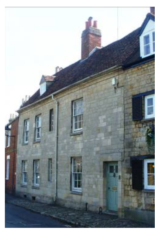
No. 10 St Andrew's Road

to provide symmetry and proportion in conformance with neo-classical ideals.