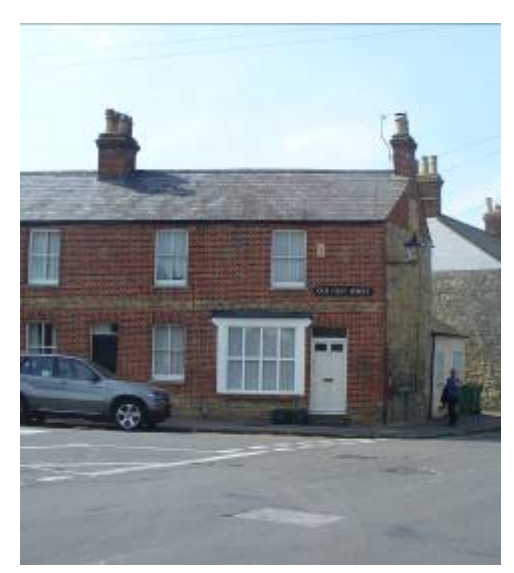
The Old Post Office at No. 94 Old High Street

box to the sidewall, despite its conversion to residential use. This was Headington's first post-office and continued in use as a grocer's shop first under the name of Rudd's and subsequently under several owners. It remained as a shop until the 1970s. Just a few doors to the south, the small Whitewashed cottage at No. 86 Old High Street was a butcher's shop owned by another member of the Berry family. It has been restored as a dwelling in recent years with the loss of the shop window.