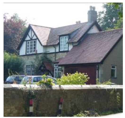
No. 6 The Croft

materials and features. Again the use of limestone helps to integrate these buildings with the older structures of the village.