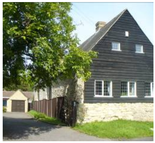
The Barn at Barton Lane stands out as a building formerly used for agriculture

In addition to the houses and cottages of the rural community, the conservation area contains several examples of the agricultural buildings that served its farms and smallholdings. Perhaps the best example of these is the 18<sup>th</sup> century barn at Barton Lane, now converted into housing. Others include the barn to the west of Bury Knowle House, a building adjacent to No. 20 St Andrew's Road (Laurel Farm House) and another small barn in the grounds of the John Radcliffe Hospital. As noted above the White Hart Inn also retains a small barn of 18<sup>th</sup> century construction facing onto The Croft, which retains many original features. These buildings take a variety of forms but their agricultural purpose is normally readily understood by the onlooker as a result of original features such as their barn or stable doors, distinctive window forms and absence of lighting to upper floors or attics. As such, they make an important contribution to the rural character of the conservation area.