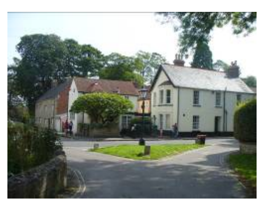
A small green space between Old High Street and The Croft

two of these landscapes. Along with the parkland and small fields, these larger gardens provide a buffer of open space between the village and surrounding urban development that helps to preserve its rural character.