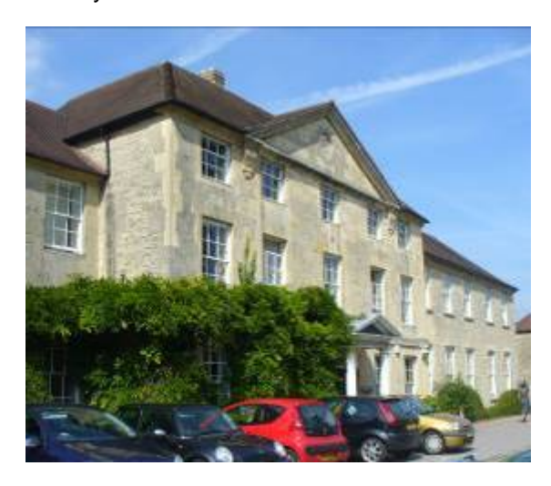
Headington Manor, built by Sir Banks Jenkinson in 1779

the map accompanying the enclosure award, although the present building was clearly remodelled later in the 19th century.