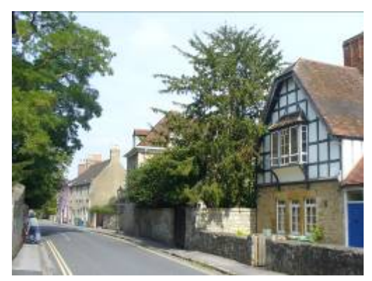
The British workman (right of frame), Old High Street

playground and pavilion. The house was converted for use as a public library in 1934 and the upper floor came to house the mother and baby clinic that had operated from the British Workman