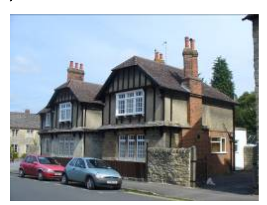
Linden Cottages, Old High Street

The new building was prominently located on Old High Street facing Linden Farm. A convent of Dominican Sisters bought Linden Farm in 1923, and renamed it as "The Priory of All Saints and All Souls", which was in turn purchased by The Congregation of The Sacred Heart in 1968 who simplified the name to The Priory. They used the building as a mixed religious institution and students' hostel. The local builder Charlie Morris replaced the three cottages just to the north of the Priory in 1909 with two semi-detached cottages in a heavy half-timbered Olde English style. Their new name 'Linden Cottages' is spelt out in initials carved in relief on the brackets that support the jettied first floor.