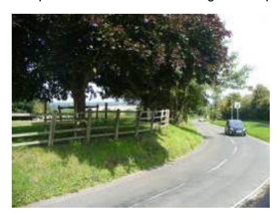
Views East at Barton Lane

This area includes the remnants of the agricultural land on the edges of the historic village, which have been separated from the surrounding landscape