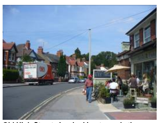
Old High Street view looking towards the conservation area

The conservation area lies at a transitional point between the suburban landscape of Headington and the rural hinterland beyond the ring road. To the north west, Dunstan Road runs steeply downhill to the Northway Housing Estate at Saxon Way. Headington Cemetery covers the ridge of the hill to the south of Dunstan Road and the vast complex of the John Radcliffe Hospital lies directly west of the conservation area. Here the surviving open parkland and buildings of Headington Manor inside the conservation area provide a contrast with the monolithic elevations of hospital buildings just outside its boundary. Osler Road continues south from the conservation area as a residential street of Edwardian or Inter-War houses, as well as including the green of the Headington Bowls Club and the site of the new Manor Hospital (formerly the home ground of Oxford United Football Club). Osler Road leads into the shopping area on London Road just to the south.