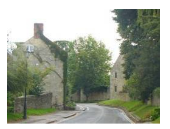
No. 8 Dunstan Road

Dunstan Road provides an important approach to the core area of the historic village from Northway and Marston but provides a contrasting character to the historic core. The area is focused along the long narrow space of the road. This has a pavement on the north side and a grass verge to the south, which is bounded by either a low, ivy-grown wall or a hedge that has grown into a mature tree line, both of which contribute to a pleasantly rural and occasionally sylvan character. Mature trees arch over the road from both sides creating a tunnel