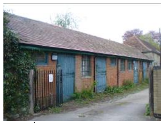
Late 19<sup>th</sup> century stable building at Bury Knowle

Villa built in the first years of the 19<sup>th</sup> century and represents a part of the move of wealthy Oxford merchants out of the city centre to the healthier climate of Headington Hill. It retains its associations with subsidiary structures, such as the coach house and stables, which were once required to support the high status lifestyle of its owners. The immediate surroundings of the house retain some of the polite landscaping of the 19<sup>th</sup> century pleasure grounds that surrounded the villa, including exotic specimen trees, such as the large cedars to the front, as well as the ha-ha or sunken fence that allows views from the house to sweep across the lawns to the open parkland beyond.