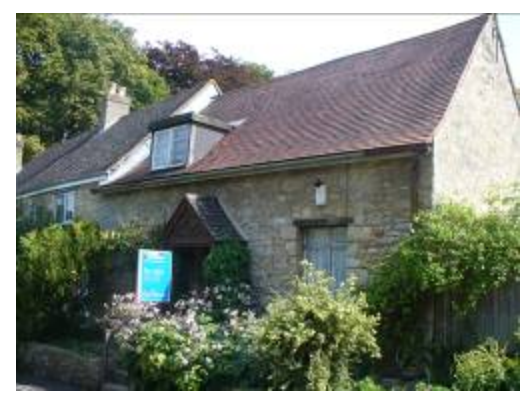
No. 18 St Andrew's Lane a small workers' cottage, probably of 18<sup>th</sup> or early 19<sup>th</sup> century construction

farms represented by the larger houses. A relatively high proportion of these buildings have been lost and replaced, including the ten on St Andrew's Road that were demolished in the 1930s. The remaining examples are to be all the more valued as survivors.