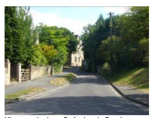
View south along St Andrew's Road between Green verges

Old High Street and The Croft, St Andrew's Road and Osler Road, and the small space between the Laurel Farm Close development and The Croft. These small green spaces contribute to the informality of development that is part of the rural character of the village, as well as forming part of the greening of the streetscene. The grass banks and verges on several routes in the conservation area, including Osler Road, Barton Lane and Dunstan Road make a similar contribution and help to maintain the 'ring of green space' that separates the village core from the surrounding suburban development.