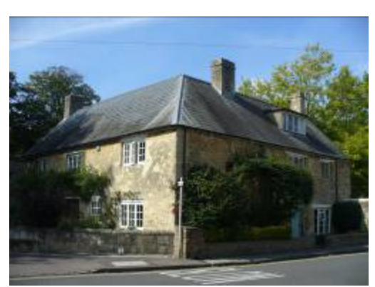
Corallian limestone with a lime render weather coating

lime mortar is important with this material to prevent damage through differential shrinkage and moisture retention, potentially leading to saturation and damage. It was used for buildings in mass (solid) wall construction, often with very thick walling that have a high thermal mass if well maintained. This is a heavy form of construction and its use determined the positioning of upper floor windows over lower to reduce loading on lintels and therefore has an influence on schemes of fenestration. It also increases the difficulty of building upwards and, therefore, contributes to the long, low form of buildings throughout the conservation area.