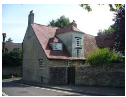
The rear of Church Hill Farm showing the stair tower and 'cat-slide' roof

are seen at The Court, The Croft and Church Hill Farm, St Andrew's Lane, whilst the stair-tower at No. 14 St Andrew's road was apparently rebuilt in brick in the 19th century. Church Hill Farm also provides a good example of the cat-slide roof added at the rear to cover two single storey extensions either side of the stair-tower. Where space has allowed, or where the street pattern facilitates it, these early buildings have an east - west axis that makes efficient use of available daylight. Some of these properties were subdivided using the central passage as a natural point of division, as recorded at No. 16 St Andrew's Road.