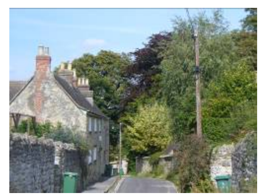
Trees in the grounds of The Grange provide an attractive backdrop to views from Larkins Lane

including Ruskin Hall and The Grange, as well as the John Radcliffe Hospital have a similar effect elsewhere.