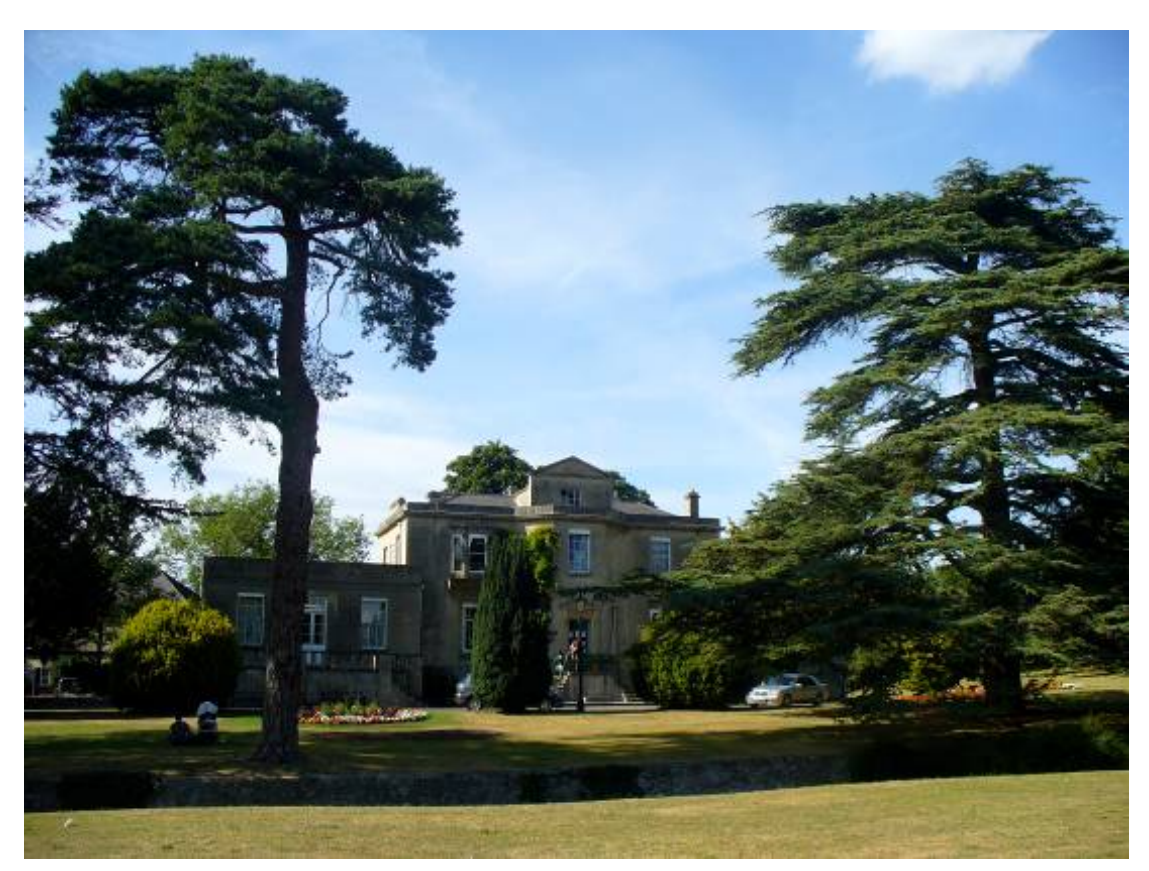
Bury Knowle House

Bury Knowle House, which stands at the centre of this landscape, is an Italianate