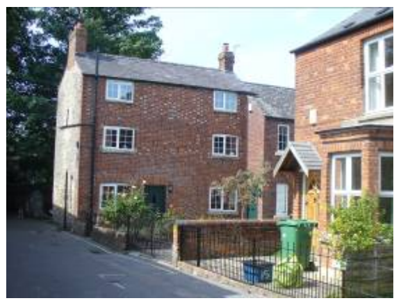
Houses of brick and stone at The Croft, built in the mid and later 19<sup>th</sup> century

In 1850 Quarry had grown to a size that justified its independence from Old Headington through creation of a separate ecclesiastical parish. During the 1860s sale of farmland south of London Road enabled the New Headington suburb to develop between the two older settlements. The rate of development escalated rapidly after the sale of Highfield Farm, although in the 1870s Headington was still described as an agricultural parish growing wheat and barley. The economic fortunes of the parish had clearly recovered by the mid-century and in 1864 major restorations were undertaken to St Andrew's Church, including a westward extension of the nave by the locally significant architect J. C. Buckler. A north aisle was added to provide even more accommodation in 1881 along with the north porch and vestry.