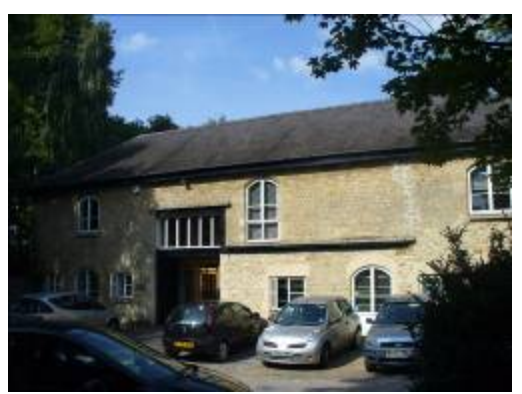
The former coach house at Bury Knowle, now used as offices

storeys, often with additional wings of a lower scale that were built to provide extra accommodation, as it was required. They are also distinguished from the farmhouses by the types of ancillary buildings with which they are associated. These include coach houses and stables, walled kitchen gardens, gate lodges and high boundary walls to their parks. These buildings are often just as ornate as the main house. The boundary walls have ornamental brick copings and monumental gate piers. The houses and their ancillary buildings stand well away from the roadside and are now often hidden from the road, although they may once have been more visible in designed vistas.