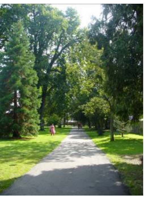
View across Parkland at Bury Knowle

View type D: Views across parkland with formal tree planting: The polite landscapes of the grand houses surrounding the village core have provided their own characteristic views, notably including wide grassed lawns studded with specimen trees or groups of mature trees. These have been consciously created to maximise the feeling of space and of an ordered rurality, devoid of the trappings of labour or agriculture and harkening to the landscapes of greater stately homes. The best examples of this type of view in the conservation area are seen in Bury Knowle Park. This landscape received additions during the 20th century as a result of its role as a public park, including tree lined walks, which help to create additional designed views.