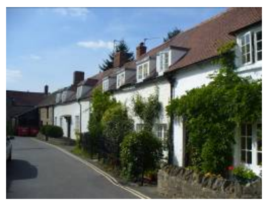
View west along cottage frontage at The Croft