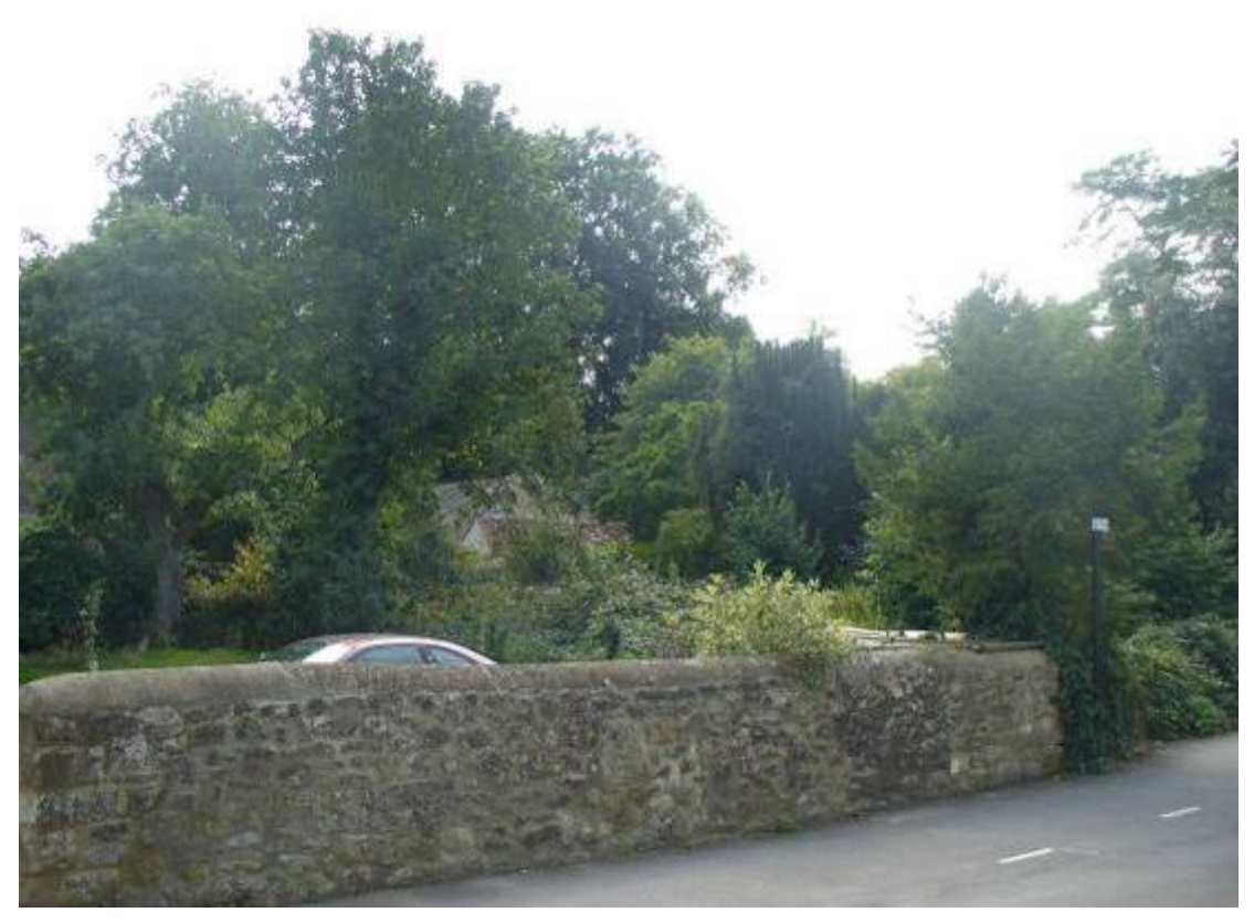
View across gardens at The Croft towards Headington House