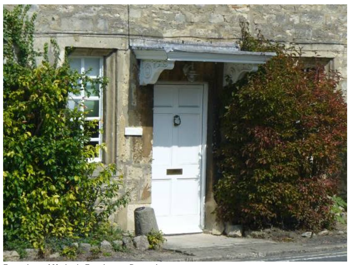
Front door of Mather's Farmhouse, Barton Lane

Within the conservation area numerous unlisted historic buildings make a positive contribution to its character and appearance. These buildings are illustrated on Map 3. However, where a building has not been marked this should not be taken to mean that it is of no interest but may reflect lack of access to land during the survey for this appraisal.