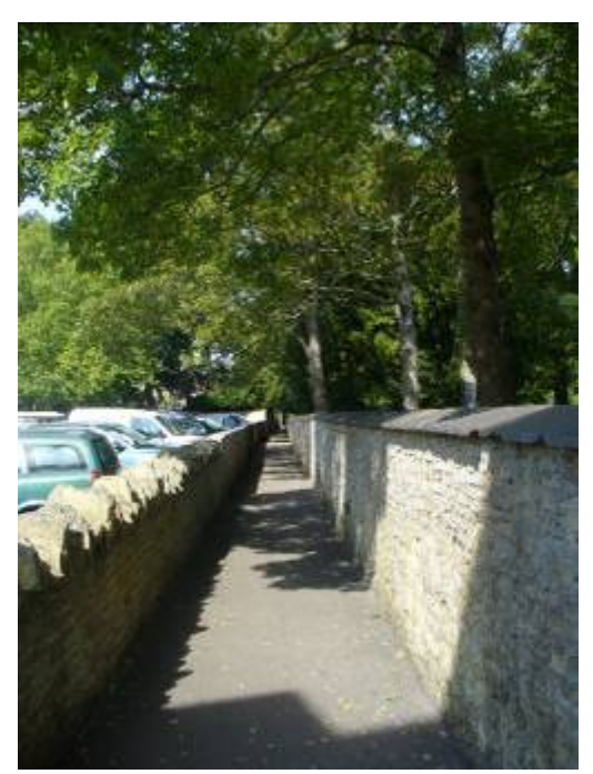
Coffin Walk next to Bury Knowle Park

Headington on Corpus Christi College's map of its landholding produced in 1605. Between Osler Road and Old High Street it runs along a sunken course, with banks to either side, which are topped by garden fences and shrub growth. Stephen Road provides a gap in the enclosure of the southern side of this alley. A third narrow alleyway runs along the western edge of Bury Knowle Park. It is named Coffin Walk, recording the creation of this route as an alternative to the processional route for funeral parties from Quarry to St Andrew's Church across Bury Knowle Park before the building of Quarry Church.