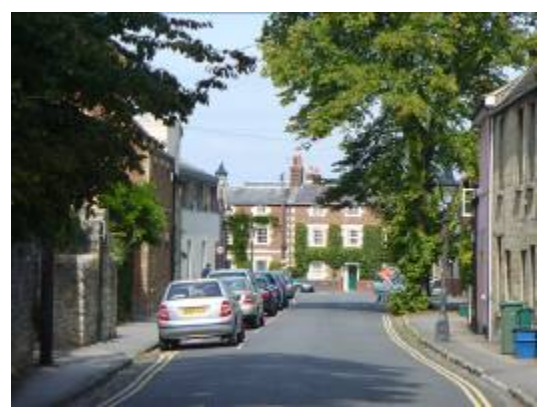
A channelled view along Old High Street

View type A: Views channelled along streets:_Throughout much of the conservation area, views are enclosed within streets by the surrounding buildings and trees to focus attention along the routes of roads. These views emphasise the importance of the street pattern to the structure of spaces within the village and to the historic development of the settlement along it. The gentle rhythm of divisions between buildings and properties provides a key element to these views. The views north and south along Old High Street in particular benefit from the pinchpoints, where the road is narrowed or where large trees arch over the road, often providing a small focal point in the distance. The trees and greenery of the village gardens make an important contribution to the character and aesthetic quality of these views