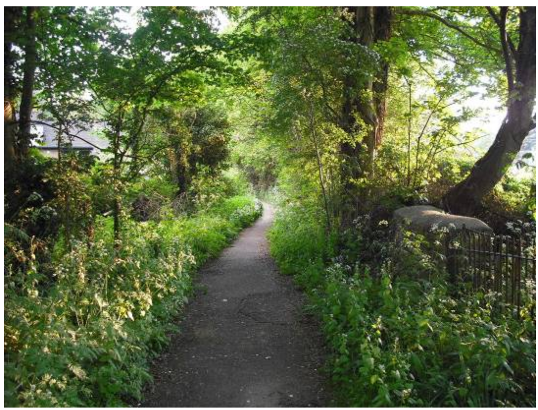
Looking south at Stoke Place bridleway

In the views to the conservation area from the higher ground north of the Bayswater Brook, the green open spaces in this character area form the setting of some of the village's listed buildings, including St Andrew's Church and Ruskin Hall. The green wedge of space that it creates in these views, running between the built up Barton and Northway estates, illustrates the distinctiveness of the character of Old Headington from its surrounding communities.