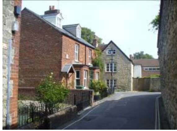
Groups of buildings cluster around narrow lanes at The Croft

metres from the Old High Street entrance, runs through to Osler Road with the grounds of Headington House and Sandy Lodge on its south side. On it north side there is a scatter of development including Victorian semi-detached cottages, older houses of 17<sup>th</sup>, 18<sup>th</sup> and early 19<sup>th</sup> century construction, as well as the small converted chapel of Croft Hall. The side boundaries of properties in the Laurel Farm Close development form a significant portion of the northern side of this path. A side spur also provides access to Osler Road at The Court. West of this point a more continuous frontages of houses and cottages addresses the footpath on its north side. The second, northerly arm running off the main north south route has a continuous frontage of small cottages and other buildings on its north side but is more open to the south, with some open plots running through to the southerly arm. At its west end this route narrows to an unusual unmetalled green footpath that runs in front of No. 8 The Croft and curves around to the south to join the southerly arm next to Croft Hall.