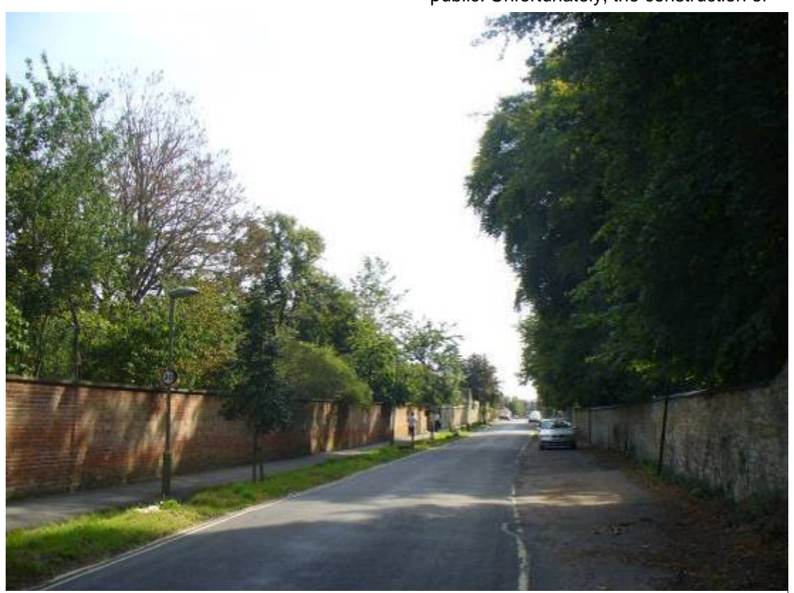
View south along Osler Road

As a result of their inclusion in the grounds of the John Radcliffe Hospital, the buildings and formal landscape of Headington Manor are accessible to the public. Unfortunately, the construction of