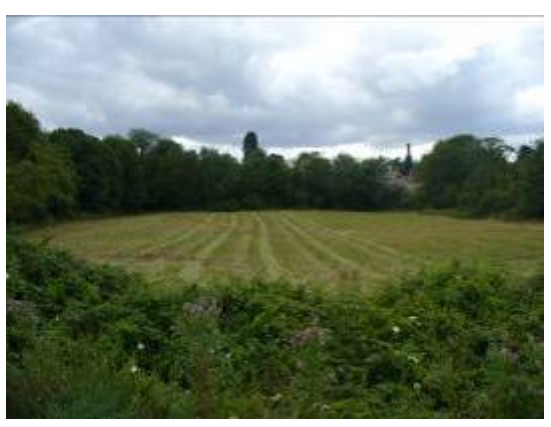
Trees line the edges of small fields to the north of Ruskin Hall

apple varieties. The derelict garden plot in The Croft also contains several veteran apple trees that may represent historic local varieties.