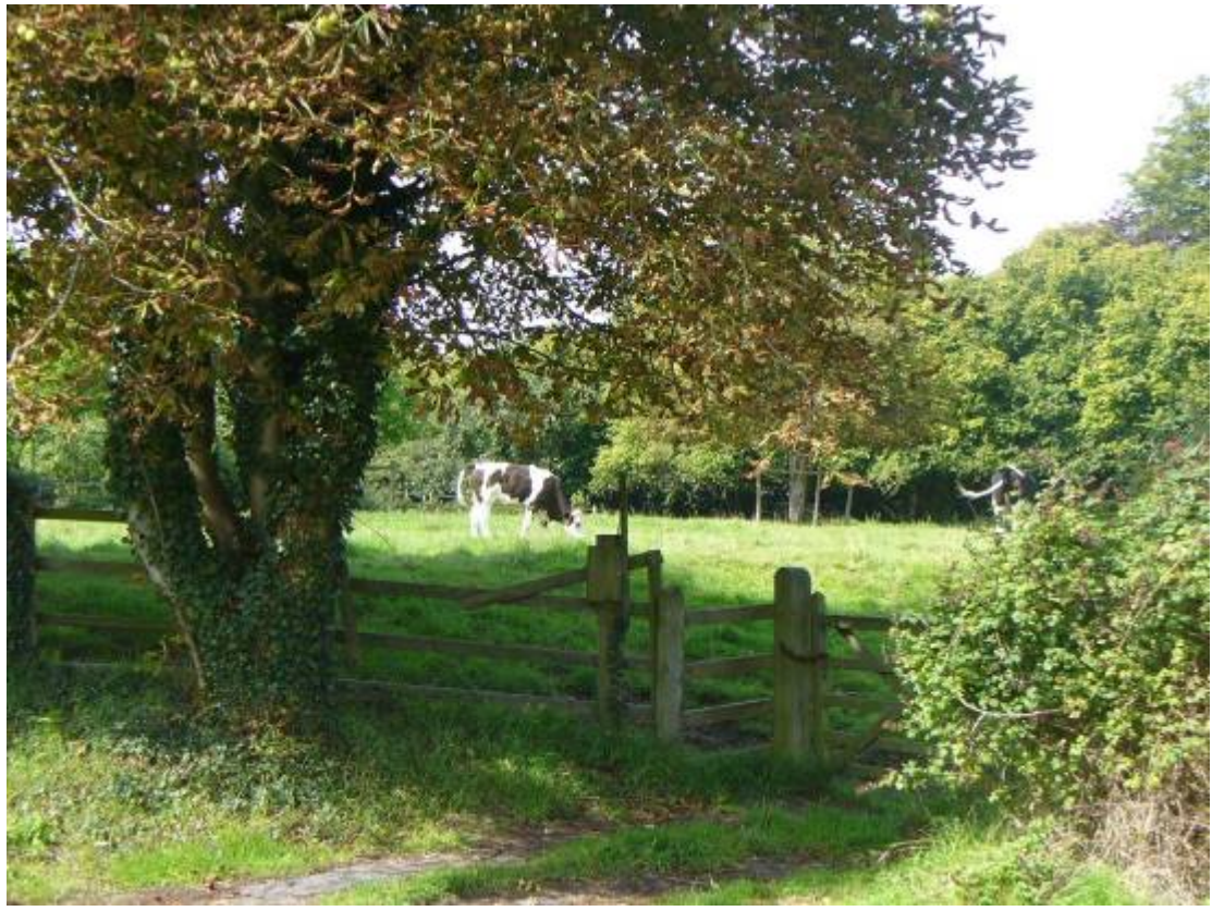
Oxford Preservation Trust's fields at Barton Lane