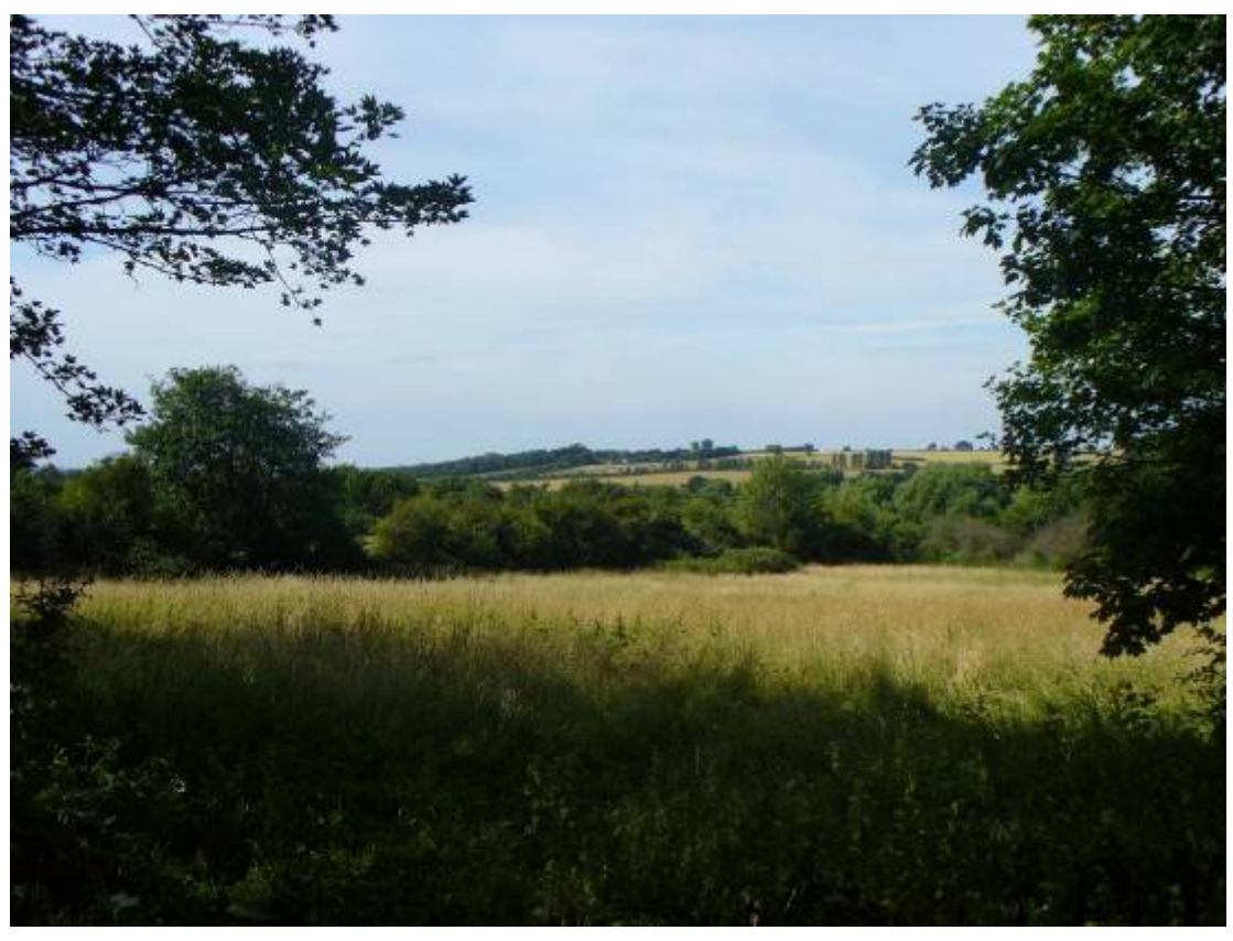
View north west from Stoke Place bridleway

Stoke Place is continued within this area as an attractive public bridleway running northwards from the Dunstan Road Character Area lined by trees that help green it. The bridleway runs up to the ring road between land owned by Ruskin College and other privately owned fields. To the west, iron railings with an unusual gate form a distinctive boundary to Ruskin