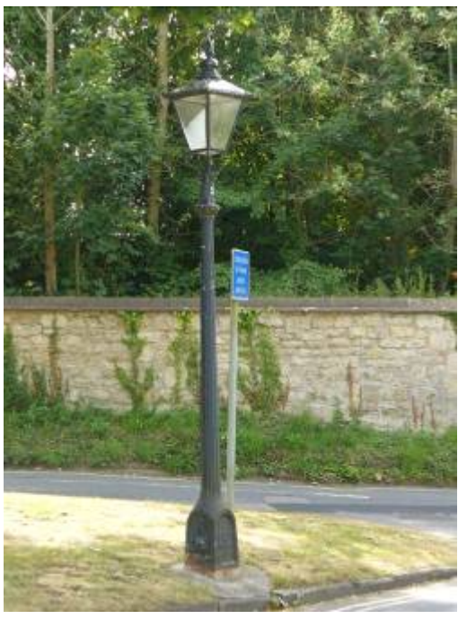
A 'Lucy and Dean' lamppost

The parkland areas have specific furniture, which reflects their use as a recreational and community resource. These are described in more detail in the character area descriptions below.