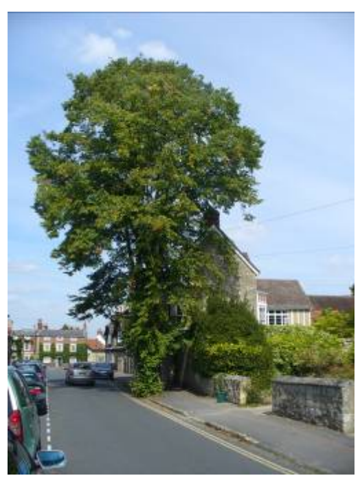
Mature lime trees at Old High Street

Within the conservation area the spaces where the public have a right of access (referred to as the public realm) include the parks, streets and alleys. The materials used to pave these areas, the planting and street furniture all make an important contribution to their character.