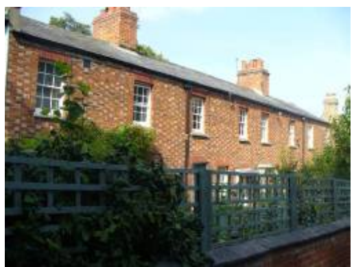
Nos. 2 - 5 The Croft

The tall trees in the grounds of Headington House form a backdrop to views south and west across this area and create a tunnel of foliage over the arm running to Osler Road.