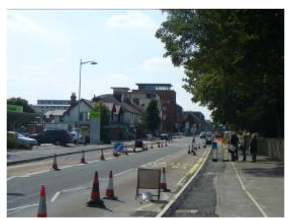
London Road south of the conservation area

Along the southern edge of Bury Knowle Park the conservation area adjoins and includes part of the busy route of London Road. This is an important traffic route into the city from the east, as well as serving the residential areas and business of Headington. Facing the conservation area London Road has a very mixed frontage, which includes historic buildings of local significance such as St Andrew's Primary School and the Victorian-era Post Office, as well as small high street businesses, private houses and a small supermarket. The long, straight route of London Road provides dramatic views along the front of the park's boundary walls.