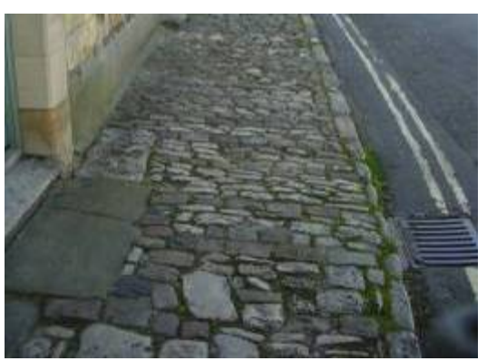
Area of listed Paving at St Andrew's Road

Paving: When many of the houses in the conservation area were built the surrounding roads would have had a basic surface of beaten earth as preserved in the small footpath near No. 8 The Croft. Areas of historic paving are decidedly unusual in rural contexts and, as such, the 18th century limestone cobble pavement outside the White Hart Inn is a particularly rare survival and makes a significant contribution to the setting of the adjacent group of listed buildings. As such it has been given listed building status in its own right. The pavement has been re-laid in the recent past, somewhat inexpertly, but still makes an important contribution to the character of this part of the conservation area.