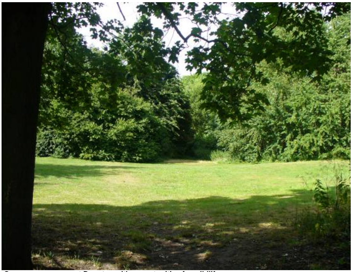
Green open spaces at Dunstan with opportunities for wildlife