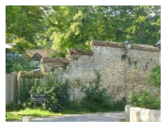
Stone boundary walls at The Croft

neighbours. Now they create intimate, enclosed areas with a tranquil ambience.