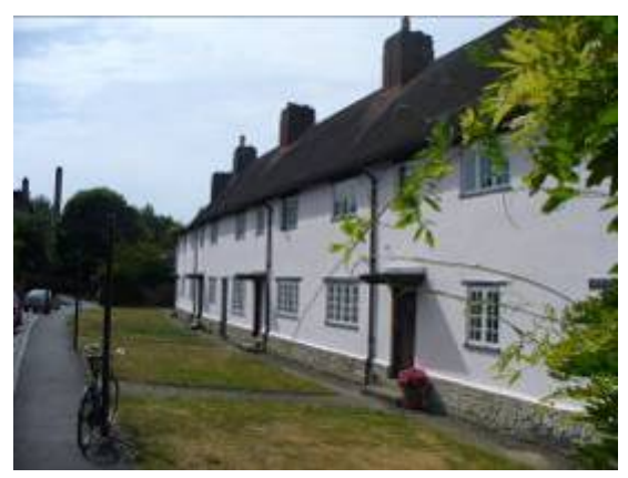
Fielding Dodd's houses at St Andrew's Road

The theme of building contemporary housing within the area continued into the 1970s with the construction of the buildings of Nos. 10 to 18 Dunstan Road in a highly contemporary style by the architects Ahrends, Burton and Koralek.