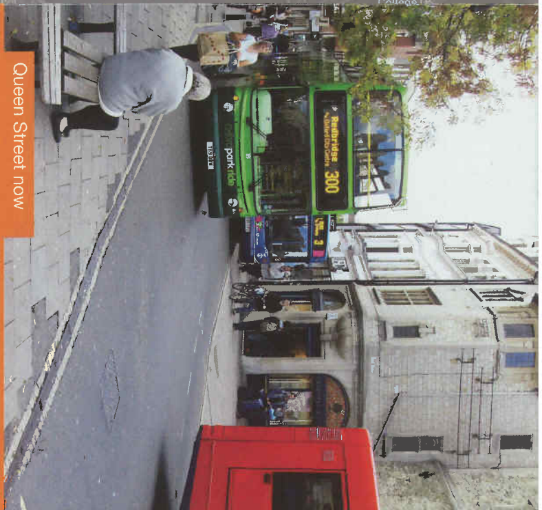
Queen Street now