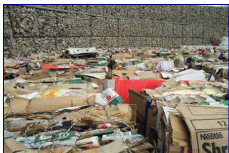
Recycling facilities

Designing buildings and their details with deconstruction in mind enables the building at the end of its useful life-span to become the resource for future developments and complete the resource cycle. Designing buildings with their deconstruction in mind will help minimise the future costs involved in sending waste to landfill, provide materials for the replacement of the building or resale if appropriate when the building reaches the end of its life-span. This responsible outlook can also help avoid financial penalties in the future due to changing legislation as legislation in this area is likely to be tightened over time. A deconstruction plan and product/material index can be produced to document the areas addressed in the design and assist with deconstruction in the future. Examples of ways to ensure materials are recycled rather than wasted in the future include: avoiding composite materials; using lime-bases rather than Portland cement for mortar and renders to enable easier recycling of bricks; using mechanical fixings rather than adhesives; and using dry construction techniques where possible.