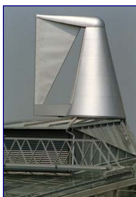
Natural ventilation wind cowl, Jubilee Campus, Nottingham

The use of green and brown roofs can also increase energy efficiency. A green roof is one that has been surfaced with a growing medium, with vegetation on top of an impermeable membrane; brown roofs work on the same concept but with a broken substrate replacing the organic growing medium. Intensive roofs have a deep layer of soil, and can grow and support lawns and shrubs and are designed for people to use; extensive roofs have a shallower layer of soil, are generally planted with mosses and sedums and are not designed for such use. Green and brown roofs can provide buildings with more thermal mass (see below), prolong the life of the roof, reduce sound transmission, moderate surface water run-off, provide green space for wildlife and people, and look attractive. The average weight of a fully saturated extensive roof is comparable to the weight of a gravel ballast conventional roof.