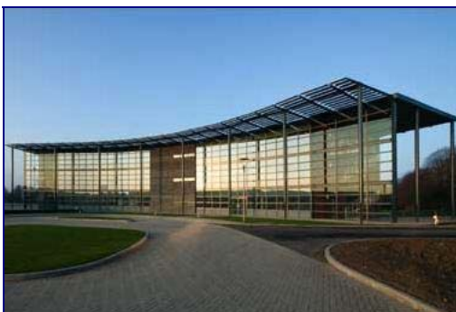
Environment Agency Offices, Red Kite House, Howbery Park, Wallingford (Scott Brownrigg Architects - www.scottbrownrigg.com )