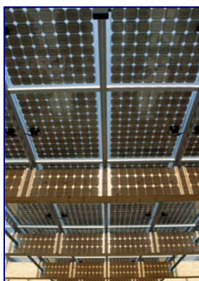
Photovoltaic, Jubilee Campus, Nottingham

There is limited potential to use hydro technology for electricity generation within the Oxford City boundaries. The potential for such schemes depends on the volume of water flow and the level of head (vertical drop of water). Locations that might be suitable are old mill sites and river weir structures.