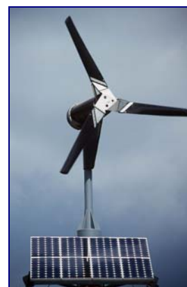
Sainsbury, Greenwich