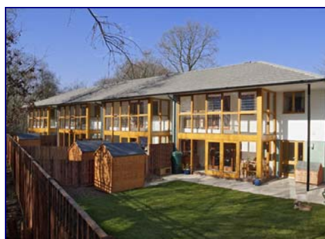
Beaufighter Road development, West Malling, Kent (Fry Drew Knight Creamer Architects)