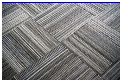
Recycled tiles