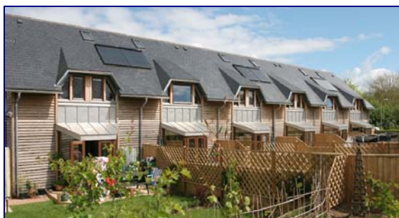
Eco homes at Oak Meadow, South Molton, Devon (Gale and Snowden Architects/)