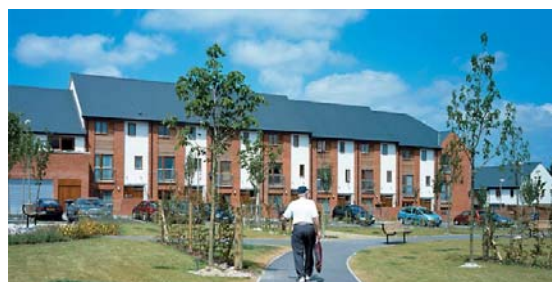
Affordable housing at Oakridge Village, Basingstoke (HTA Architects/@TimCrocker05)