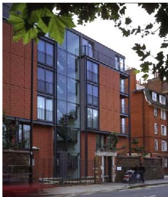
Affordable Housing at Beaufort Court, Fulham (Photo by Feilden Clegg Bradley Architects/Mandy Reynolds)