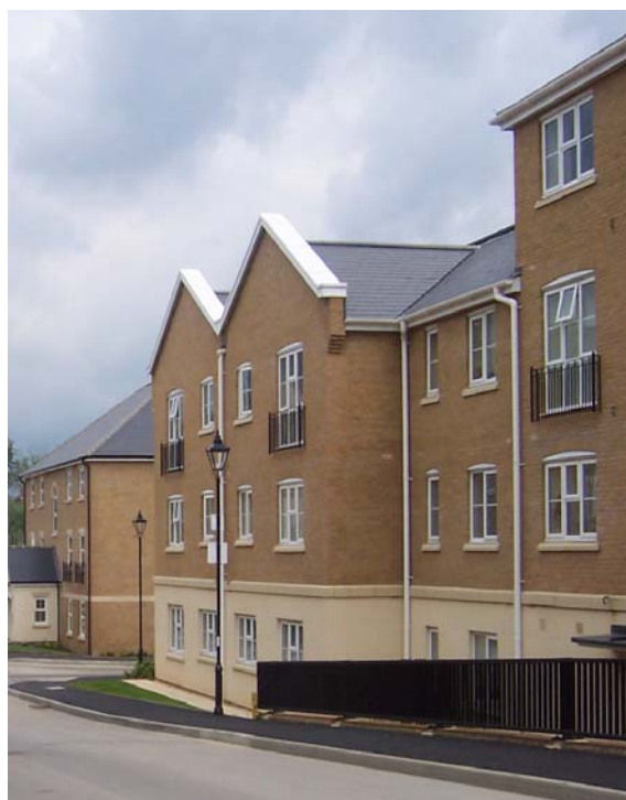
Affordable Housing at Elizabeth Jennings Way, Oxford

Local authorities should have regard to the South East Plan when developing their Local Plan policies.