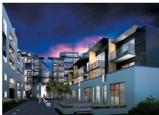
Affordable Housing at Point Pleasant, London SW18 (PCKO Architects)