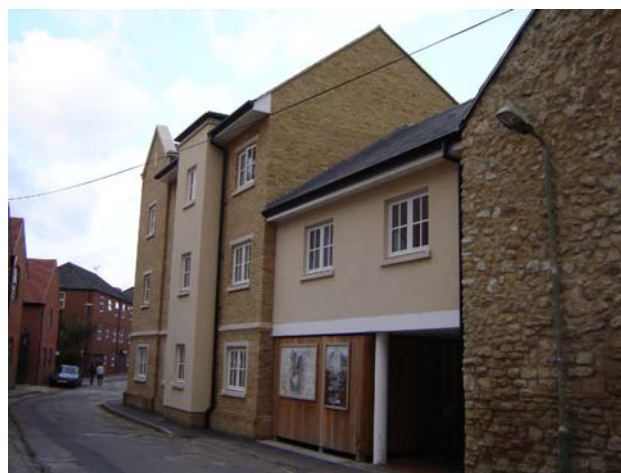
Affordable Housing at Bookbinders Court, Oxford