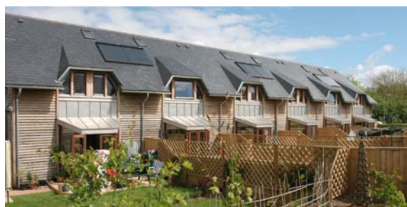
Affordable housing Eco Homes at Oak Meadow, South Molton, Devon (Gale and Snowden Architects)

70. One-bedroom social rented affordable dwellings tend to be occupied by the most vulnerable single people on the housing register, some of whom would benefit from independence from other similarly vulnerable people. Separate front doors will also help deliver 'active frontages' which is often very desirable for urban design objectives and crime and safety issues. Therefore the City Council will seek some one-bedroom social rented dwellings to be on the ground floor, and to have an independent front door that does not lead off a communal hallway. The design of these dwellings should reflect the specific needs of this type of tenant.