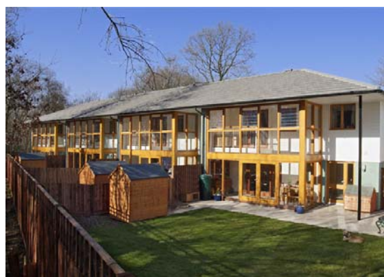
Affordable housing using passive solar energy and rainwater harvesting at Beaufighter Road, West Malling, Kent (Architects: Fry Drew Knight Creamer Architects)

75. In accordance with the EcoSE Manifesto the City Council expects, in all cases, the affordable housing to meet EcoHomes 2 Standard 'Excellent' and Energy Efficiency Best Practice 3 specifications for insulation, heating system efficiency and lighting. This should be confirmed in the planning application or accompanying documents.