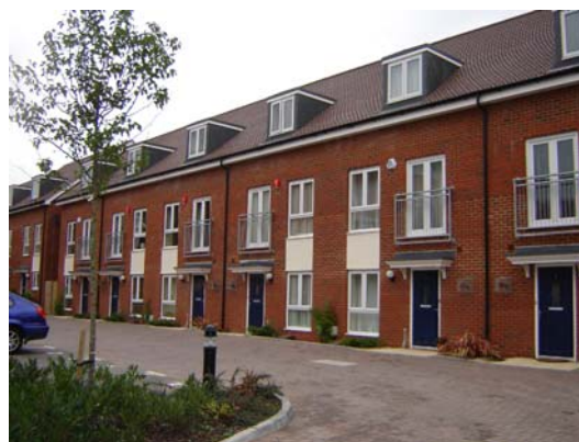
Affordable Housing at Rivermead Park, Oxford

12. The definition is set out in sub-section 7.1 of the Oxford Local Plan 2001-2016, an extract of which is at Appendix 1 .