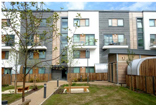
Affordable housing at Chapel, Southampton (Architects: Chetwood Associates)