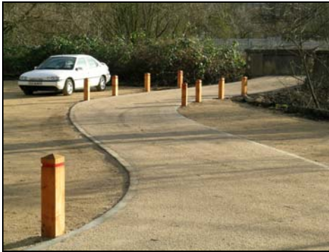
Cycle track off Walton Well Road