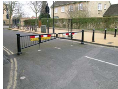
Environment improvement scheme Jowett Walk

70. The County or City Council (depending for example on land ownership) will seek, where appropriate, contributions towards environmental improvements such as enhanced pavement materials, street furniture, trees and landscaped areas, lighting and signs (including tourist information signs). The City Council will also seek contributions for the provision or enhancement of public squares and spaces.