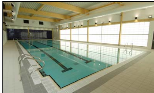
Barton swimming pool