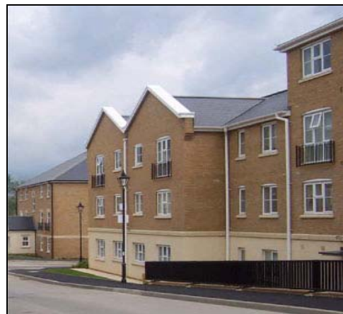
Affordable housing at Elizabeth Jennings Way