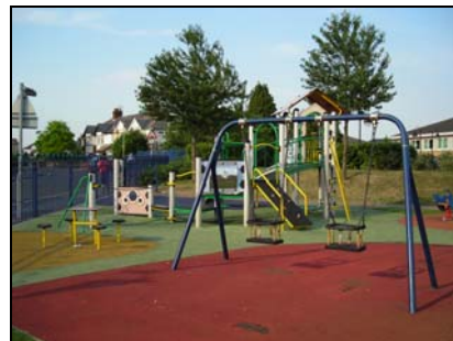
Barnes Road pocket park