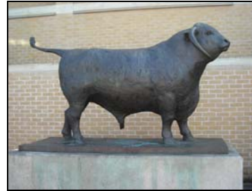
The bull statue outside the Said Business School