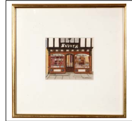
Catalogue No. 198 Photo No. 14

Medium: Watercolour Signed: Yes Dated: No Production date 1987 Condition: Good Frame: Contemporary Glazed: Yes Size: 4 X 4.5ins (10 X 11.5cms) Location in Town Hall: Jury Room Artist's Information: Marjorie Collins Marjorie Collins Subject Information: as title