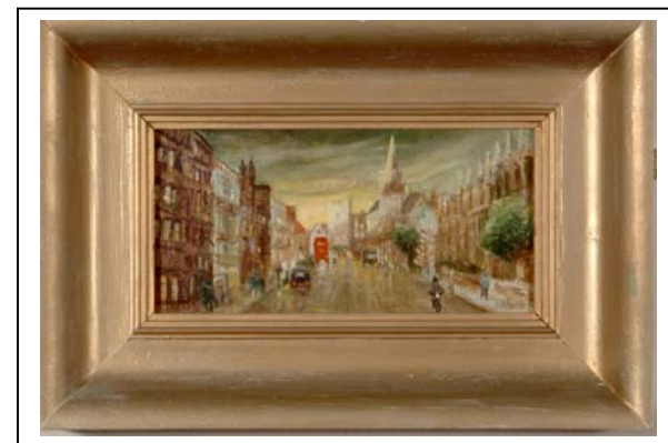
October Shower, The High towards Carfax Artist's Name: N Jutsum