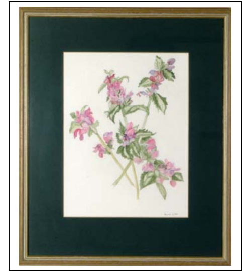
Catalogue No. 259 Photo No. 27

Medium: Watercolour & Pencil Signed: Yes Dated: No Production date 1994 Condition: Good Frame: Contemporary Glazed: Yes Size: 10 X 7.5ins (25.5 X 19cms) Location in Town Hall: Jury Room Artist's Information: Muriel Willis Subject Information: as title One of a pair.