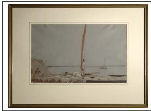
Catalogue No. 40 Photo No. 51